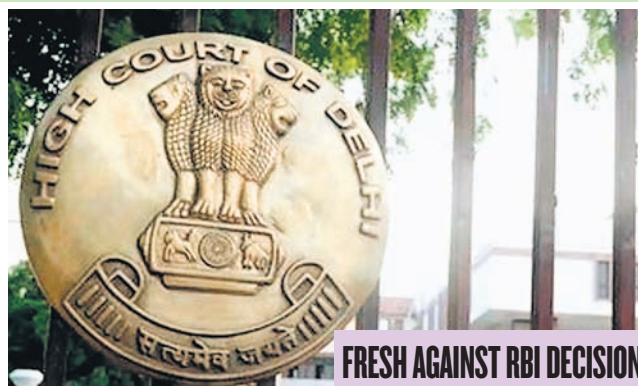
Team Absolute | New Delhi