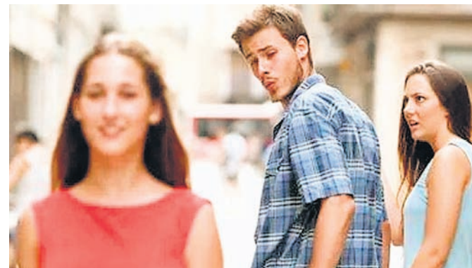
SAN FRANCISCO | Agencies

Married individuals who engage in extramarital affairs experience a sense of satisfaction, display limited remorse, and believe cheating doesn't hurt their marriage, a new study has shown. According to the study published in the journal Archives of Sexual Behavior, a size-