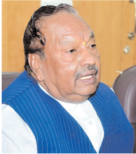
The move came ahead of the party's announcement of its first list of candidates for the Assembly polls scheduled on May 10.

◆ Weeks ahead of the May 10 Assembly elections in Karnataka, former Deputy Chief Minister and BJP's old warhorse in the state, K.S. Eshwarappa, wrote to BJP President J.P. Nadda on Tuesday to communicate his decision to quit electoral politics.