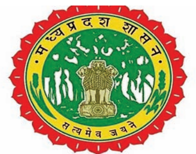
mp forest department