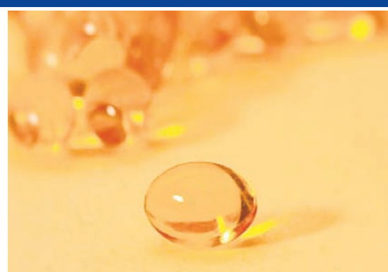
LONDON | Agencies

"Of course, vitamin D is not itself an anti-cancer drug, but its normal serum level is needed for the proper functioning of the immune system, including the response that anti-cancer drugs like immune checkpoint inhibitors affect. In our opinion, after appropriately randomised confirmation of our results, the assessment of vitamin D levels and its supplementation could be considered in the management of melanoma." Lukasz Galus, Poznan University of Medical Sciences, Poland