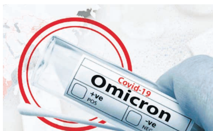
Team Absolute | New Delhi

The Omicron subvariant XBB.1.16, present in 33 countries, is making a fresh surge in Covid infections as well as deaths in Italy, the US, the UK, Vietnam, and other nations, including India. According to the Italian Ministry of Health, the country recorded 27,982 new positive cases during April 14 and 20, compared to the previous week (21,779). The number of deaths also increased by 48.1 per cent, totalling