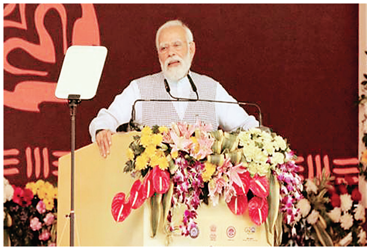
Earlier in the day, Prime Minister Modi launched various projects,

"Though, during the 1990s, the Congress government did take some steps for development, but those were not enough. The Congress destroyed the Panchayati Raj system, which was the dream of Mahatma Gandhi. After 2014, rural India has started witnessing developments in