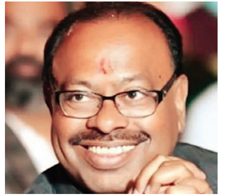
(Maharashtra Assembly) election together."

Reacting to the NCP chief's remarks, Raut said, "Maha Vikas Aghadi will remain. Its prominent leaders are Uddhav Thackeray and Sharad Pawar. In 2024, MVA parties will fight