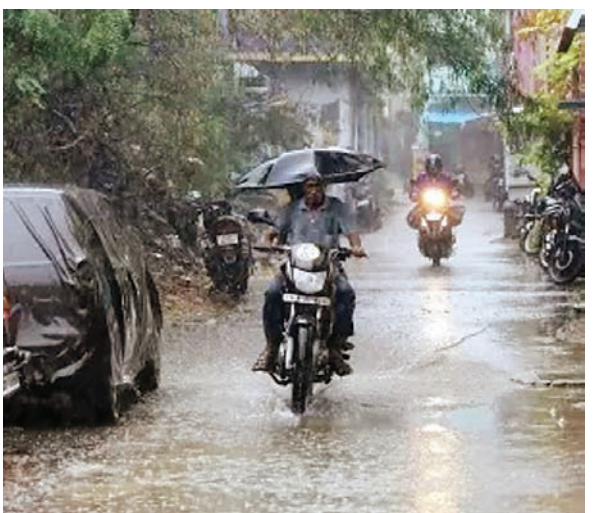
mercury in the next few days in many parts of the state

on April 23." The statement also said that light to moderate rains with thunderstorms will occur at a few places in Puducherry and Karaikkal on April 24 and April 25.