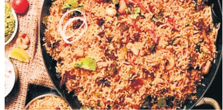
Team Absolute Hyderabad

eople in Hyderabad ordered a whopping 10 lakh biryanis and 4 lakh plates of haleem on leading food-delivery platform Swiggy during the holy month of Ramzan.Ramzan order analysis report released by Swiggy on Friday highlights the food trends in the city during Ramzan.The order analysis reveals that traditional favourites like haleem, chicken biryani and samosas remain the most popular dishes during Ramzan.Living up to