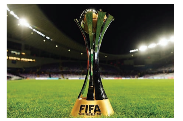
Argentina and Uzbekistan will be played at the Santiago del Estero Stadium, with three more matches to be

Twenty-four teams will compete in six groups across four cities, La Plata, Mendoza, San Juan and Santiago del Estero. The opening match between