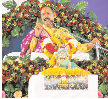
Team Absolute | Bhopal