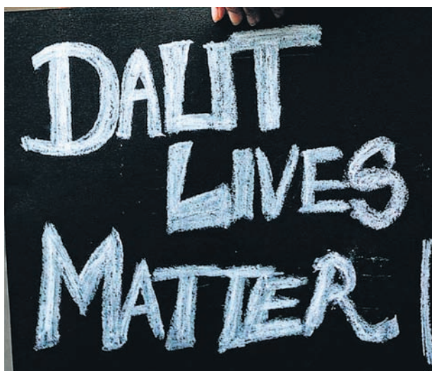
Dharmaraja Draupati Amman temple and even beat us up. They said that we are not even allowed to take photographs of the idol, leave alone providing entry."

Tamil Nadu's Villupuram was tense on Monday after caste Hindus did not let Dalit community members enter the local Shri Dharmaraja Draupati Amman Temple at Melpatti village.