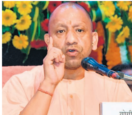
ment on applications submitted by any such family belonging to backward classes. So far, the state government has provided grants of Rs 771 crore to 3,85,514 beneficiaries under the Marriage Grant Scheme.

The Yogi Adityanath government will spend Rs 150 crore to conduct the marriages of poor women belonging to other backward classes (OBCs).