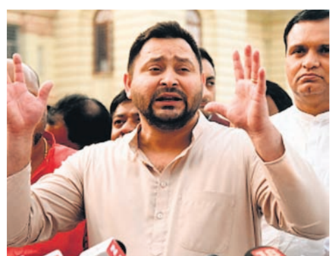
land at prominent locations in Patna and other areas were illegally acquired by the family of Lalu Prasad in lieu of jobs provided in Railways. The current market value of these land parcels is more than Rs 200 crore and several benamidars, shell entities and beneficial owners for these lands have been identified.

The Enforcement Directorate (ED) has summoned Bihar Deputy Chief Minister Tejashwi Yadav on Tuesday in connection with the alleged land for job matter involving his father and former Railway Minister Lalu Prasad Yadav and other family members.