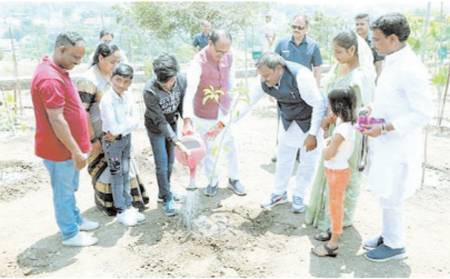
Team Absolute | Bhopal