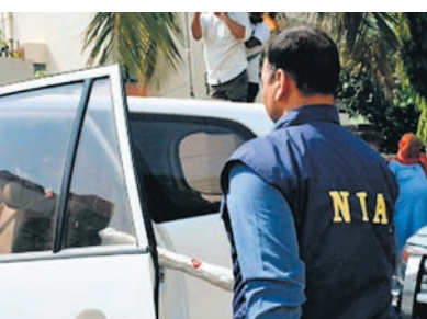
learnt that the Regional Committee member Ravindra Ganju along with active cadres of CPI (Maoist) hatched the criminal conspiracy and assembled in the Bulbul forest to attack the security forces. "In pursuit of the supporters who provide shelter and act as couriers for funds and weapons, the NIA conducted searches at the premises of the accused in Lohardaga and in Latehar district," the central probe agency said.

The National Investigation Agency (NIA) on Monday said that they conducted raids at nine locations in Lohardaga in CPI (Maoist) case and arrested a man along with illegal arms.