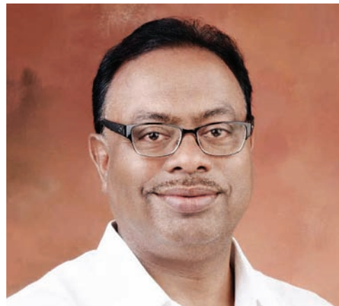
"The BJP will insist that the Shinde Shiv Sena should contest the next elections on its (Lotus) symbol... That will be the beginning of the end of Shinde Sena," Patil warned darkly.

Going a step further, Nationalist Congress Party state President Jayant Patil said this is an indicator that 'Shinde group' will be wiped out by the BJP.