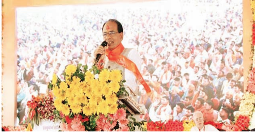
Development Course and members of voluntary organizations in the state at Bhopal's Jamboree Ground. Chief Minister Chouhan inaugurated the conference by lighting the lamp. In the beginning Saraswati Vandana and national anthem Vande Mataram were sung. The program started with the worship of girls and sisters. The Chief Minister was welcomed by

Chief Minister Shivraj Singh Chouhan has said that by uniting voluntary organizations of the state, the Jan Abhiyan Parishad, which has been associated with the works of environment protection, implementation of schemes and public welfare in adverse circumstances like Corona, is the nodal agency for public participation in government schemes. Will be made along with this, it will be mandatory for every voluntary organization working in the state to get registered in the Council's portal. The Council is playing an important role in the field of public welfare. Due to this, all the people associated with the Council should work resolutely in the Laddi Bahna Yojana started for the empowerment of sisters and the resolution to build a new Madhya Pradesh. Chief Minister Chouhan was addressing the state-level Mahakumbh of the Prasfutan Samitis of Jan Abhiyan Parishad working in the state, mentors of Chief Minister's Community Leadership