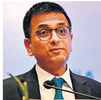
Team Absolute | New Delhi

Not every system is perfect but this is the best system available, Chief Justice of India D.Y. Chandrachud said on Saturday while defending the Collegium system of judges appointing judges, a major bone of contention between the government and judiciary. Speaking at the India Today Conclave, 2023, the CJI said judiciary has to be protected from outside influences if it has to be independent. 'Not every system is perfect but this is the best system we have developed. But the object was to protect the independence of the judiciary, which is a cardinal value. We