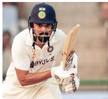
keep up to the spinners a lot. He has 3 more ODIs to go before the IPL. He can cement his place in that Indian team," added Shastri.

"Rahul can bat in the middle-order No. 5 or No. 6. In England, you have to generally keep wickets from far behind. You don't have to