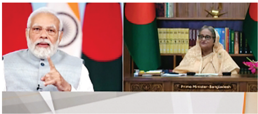
Team Absolute | New Delhi

Prime Minister Narendra Modi and his Bangladesh counterpart Sheikh Hasina on Saturday jointly inaugurated the India-Bangladesh Friendship Pipeline (IBFP) in a virtual mode. The foundation stone for the construction of this pipeline was laid by both Prime Ministers in September 2018. Numaligarh Refinery Ltd has been supplying petroleum products to Bangladesh since 2015 and this is the second cross-border energy pipeline between India and its eastern neighbour, an official statement said. Cooperation in the power and energy sector has become one of the hallmarks of India-Bangladesh relations. The IBFP is the first cross