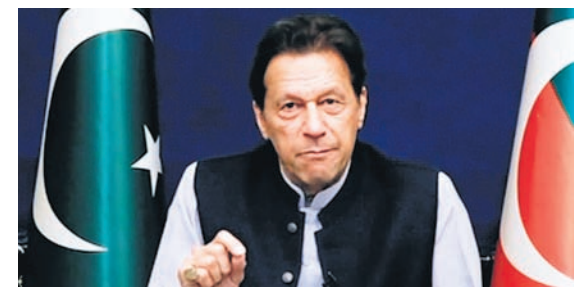
ISLAMABAD