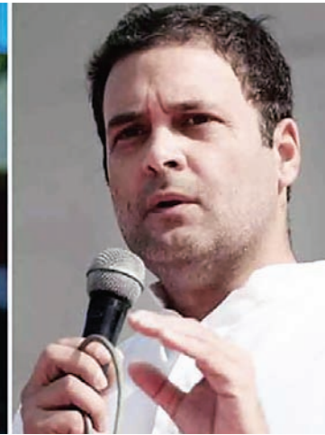
had indicated that it would take into account feelings of like-minded parties. Mr Gandhi, who was present at the meet with his mother and former party chief Sonia Gandhi, had also

addressed the assembled leaders, sources said. Today the senior leader is writing to all political leaders who, in a rare gesture, stood by him and condemned his disqualification from Lok Sabha after the two-year jail term was handed to him by a court in Gujarat last week, sources added.