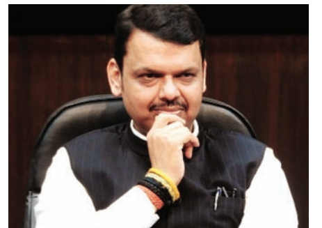
in Mumbai. The police also traced the caller to his home in the Kanhan area of the city where he was staying in darkness due to a power failure, and in a fit of anger had allegedly made the bomb threat call to mislead the police.

Not taking chances, a police team and a bomb disposal squad were rushed to the site and a thorough check was carried out inside and outside the VIP home, but nothing was found. Fadnavis and his family are currently