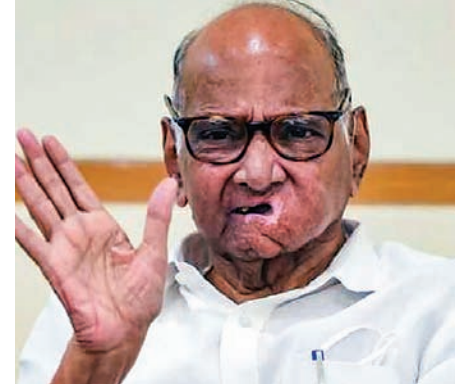
together to save democracy and constitution in this country. But do not make any statements that will create fissures. They (BJP) are trying to provoke you, if we miss this timing, then our country will surely go towards autocracy."

After Gandhi's latest comment, Thackeray said: "I want to tell Rahul Gandhi that we have come together, that's right, we have come