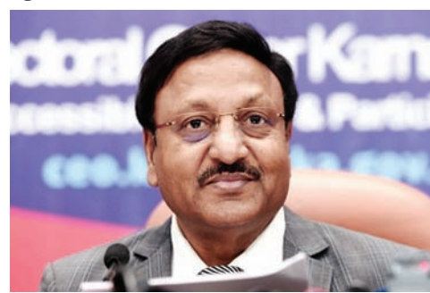
Party and Rajiv Dal.

He informed that those who participated in the exercise included the TMC, BJP, CPI, CPI(M), NCP, Asom Gana Parishad, AIDUF, Bodoland People's Front, United People's Party Liberal, and three more registered parties, Assam Jatiya Parishad, Lok Raksha