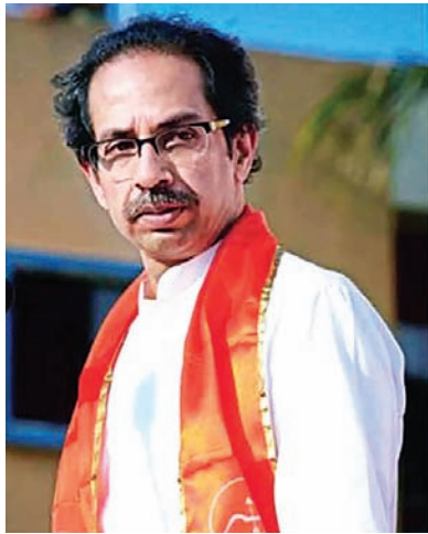
Thereafter, the 17 parties attending the meet had decided that no opposition leader would make comments on sensitive issues like Savarkar, sources had said. The Congress, they added,

"The things that have been said in the meeting -- the things that have been said, are good things. Let our unity remain intact. I think it is going well," he added, alluding to last evening's dinner meet at Congress chief Mallikarjun Kharge's home. Thackeray had pulled out of the meet, saying Gandhi's comments against Savarkar could drive a wedge in their alliance in Maharashtra.