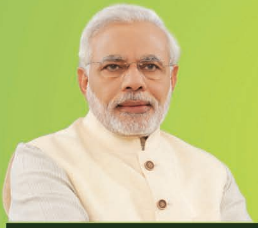
नरेंद्र मोदी प्रधानमंत्री

However, major impediments or imperatives for synchronisation for Lok Sabha and Legislative Assembly elections include bringing amendments in not less than five articles of Constitution, namely, article 83 relating to duration of Houses of Parliament, article 85 relating to dissolution of the House of the People by the President, article 172 relating to duration of the State Legislatures, article 174 relating to dissolution of the State Legislatures and article 356 relating to the imposition of President's Rule in the states.