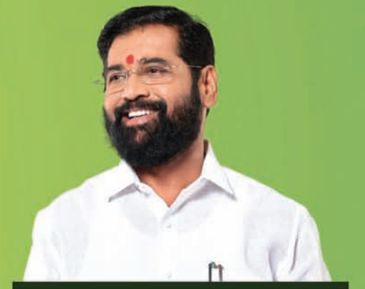
एकनाथ शिंदे मुख्यमंत्री