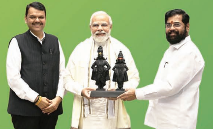
एकनाथ शिंदे मुख्यमंत्री

समृद्ध शेतकरी, सशक्त सहकार पाठीशी खंबीर, जनतेचे सरकार!