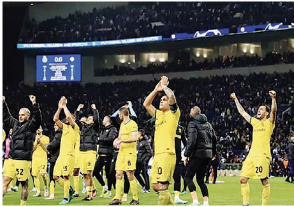
Onana finger tipped Mehdi Taremi's header onto the upright before Marko Grujic hit the post. The home side was reduced to 10 men as winger Pepe received his second yellow card, and Porto failed to turn the game around. Inter followed AC

Porto dominated the game but Inter goalkeeper Andre Onana kept the Portuguese side at bay. The Nerazzurri survived a scare deep into stoppage time, as Denzel Dumfries made a desperate goal-line clearance while