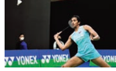
Birmingham | Agencies

Two-time Olympic medallist PV Sindhu suffered an early exit from the prestigious All England Open Badminton Championships after losing to China's Zhang Yi Man in the women's singles opening round here at the Utilita Arena on Wednesday.