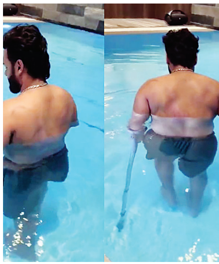
water can help improve cardiovascular fitness, balance, and range of motion of the sportspersons to gain full fitness.

As per medical literature, water walking is easy on the joints for sportspersons recovering from injuries. The buoyancy of water reduces the impact on joints. Walking in