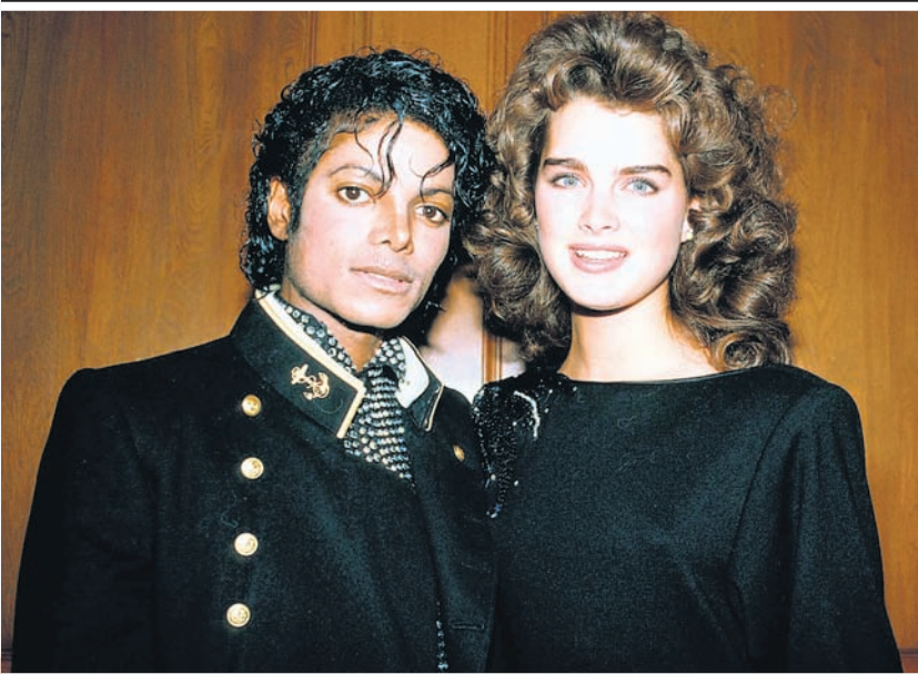
Los Angeles

Actress Brooke Shields opened up about her friendship with King of Pop Michael Jackson and said the star once lied that she was his girlfriend. Back when she was 28 years old, Jackson told a live TV interview with Oprah Winfrey that she was his girlfriend but he was reportedly in a relationship with someone else, reports mirror.co.uk. Shields said: "I called him up and I think I said, 'This is kind of pathetic that you need to do this. I am having a shot at a normal life - you cannot drag me into crazy town.'" She claims Jackson laughed it off and despite their closeness as friends, the pair never kissed or