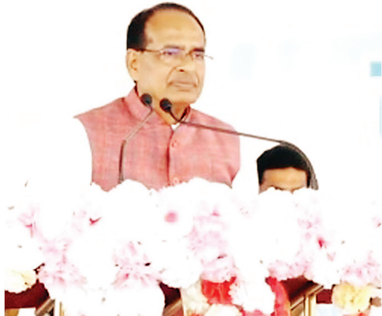
stones of 20,676 proposed development projects were laid across Madhya Pradesh. Meanwhile, the issues of 4.84 lakh people have been

It will conclude on February 25. "Our Vikas Yatra is continuously fulfilling the goals of public welfare, and presenting the development picture of Madhya Pradesh. So far, as many as 27,421 projects, which were completed have been inaugurated and handed over to the people. At the same time, foundation