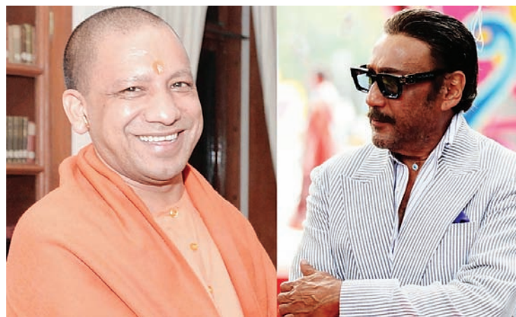
Yogi Adityanath recently visited Mumbai and held a meeting with Bollywood celebs including Suniel

He said: "Theatre ke popcorn ka keemat kam karo Sir. 500 rupiya lete hai popcorn ka. Picture banayenge, studio banayenge, lekin andar aayega kaun? (Please reduce the price of popcorn, sir. They charge Rs 500 for popcorn. We will make films, studios, but who will come to watch them in a cinema?)"