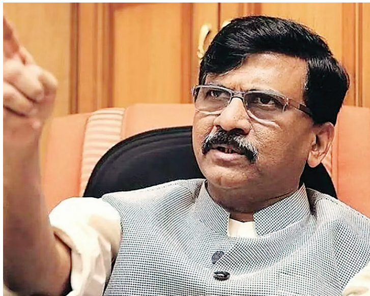
the Union Ministry to speak out against the insult to Chhatrapati

In the video, Raut can be heard saying that he expected someone in