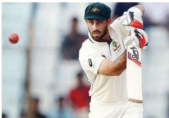
Team Absolute | New Delhi

Australia all-rounder Glenn Maxwell rued missing next month's Border-Gavaskar Trophy against India due to injury by saying it will "probably nag him" for the rest of his life.