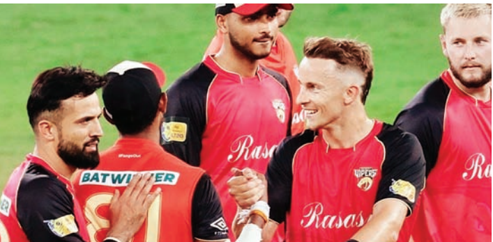
Dubai | Agencies

Desert Vipers pulled off an exciting 12-run victory over Dubai Capitals in the 20th match of the DP World ILT20 at the Dubai International Stadium on Saturday night to regain the top position in the points table.