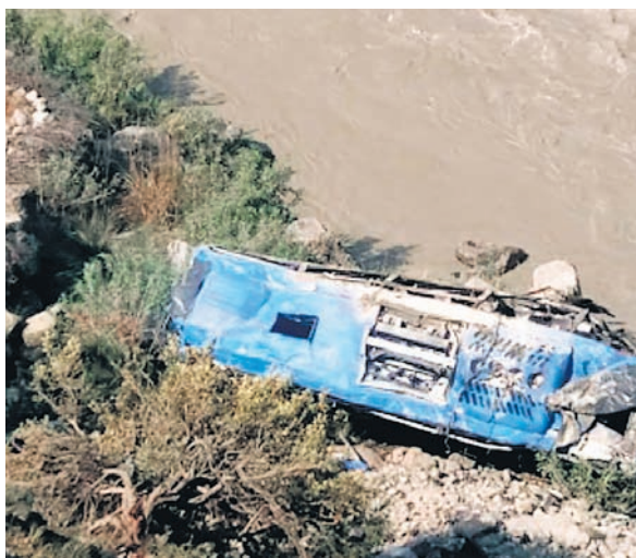
added. In a post on Twitter, Interior Minister Rana Sanaullah expressed grief