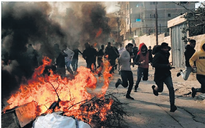
Israeli media also reported the Israeli military entered the West Bank Palestinian city of Jericho. The details of the raid were unclear and it was not confirmed by the military. Israeli Prime Minister Benjamin Netanyahu held a security cabinet meeting later Saturday to discuss the response to the

Clashes between Palestinians and Israeli police erupted in Jerusalem on Saturday evening in the wake of two anti-Israeli attacks in the disputed holy city. Israeli police entered Arab neighbourhoods in the city looking for people who may have assisted the assailants in the previous attacks, sparking clashes with Palestinians. On Friday evening, a Palestinian resident of East Jerusalem shot dead seven Israelis and wounded three others. On Saturday morning, a 13-year-old Palestinian from the city shot at a group of Israelis, wounding two of them. "The forces are encountering stone throwing, Molotov cocktails and fireworks," said a police statement, adding the police's increased operational readiness "will continue in the coming days". Footage on social media showed widespread firing of fireworks in several Jerusalem neighbourhoods, Xinhua news agency reported. On Saturday, the Israeli Defence Forces (IDF) said that a Palestinian assailant shot at a restaurant near the Dead Sea. There were no casualties and the shooter escaped from the scene.