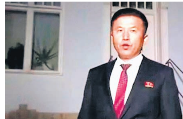
Ukraine to help its fight against Russia's invasion. Kim Yo-jong, the powerful sister of the country's leader Kim Jong-un, said Washington is crossing the "red line." "Trying to tarnish the image of the DPRK by fabri-