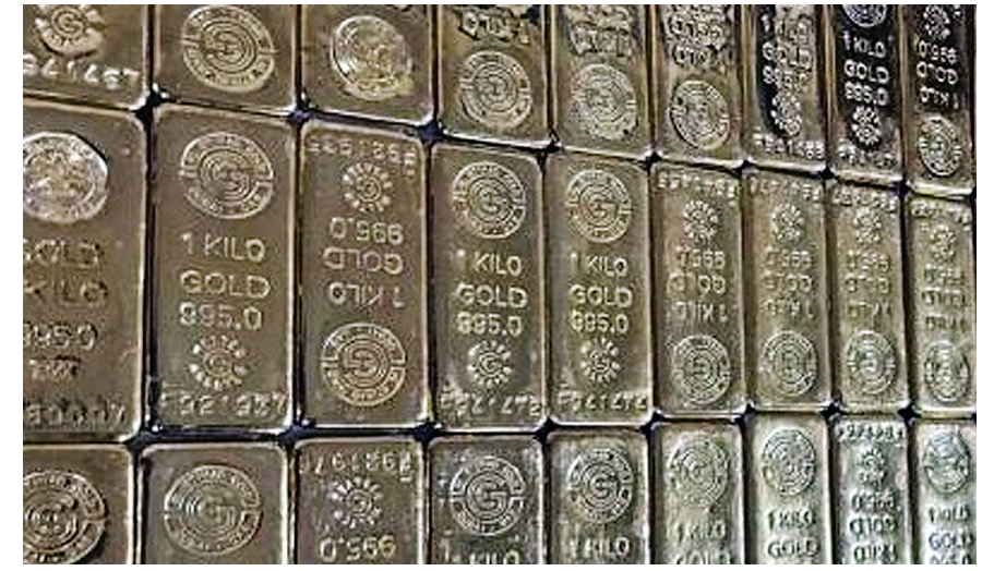
Team Absolute | Mumbai

Customs officials at Chhatrapati Shivaji Maharaj International Airport here have lodged eight cases of gold smuggling on January 27 and 28 and seized 9.5 kg gold worth Rs 4.75 crore.