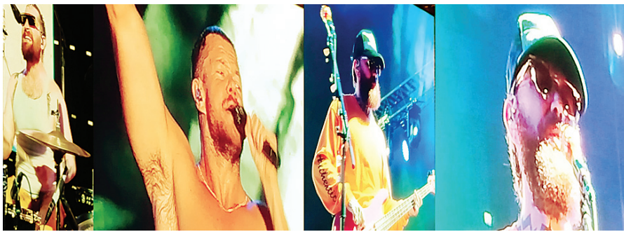
Team Absolute | Mumbai

As the Imagine Dragons took to the stage to perform at the first Indian edition of the multi-genre music festival lollapalooza, the band's frontman Dan Reynolds left no stone unturned to engage the crowd and delivered a performance that made festival-goers drown in joy. Reynolds made a point to praise Indian food and also promised to return to