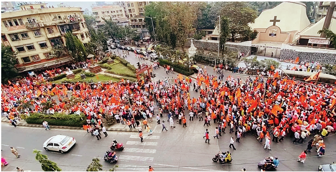
Team Absolute | Mumbai

Sunday against 'love jihad' and demanded anti-conversion laws and a crackdown on alleged land grabbing in the name of religion. Hindu Jan Akrosh Morcha, organ-