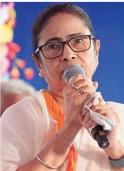
ers immediately jumped in for damage control. "Such comments are confusing