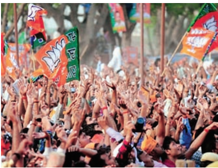
State BJP sources said already they have received the green signals from the party's state leadership that top leaders including Prime Minister Narendra Modi, Union Home Minister Amit Shah and the party's national president J.P. Nadda will be visiting the states in the next few months. "Attempts are on to bring Uttar Pradesh Chief Minister Yogi Adityanath to the state. So we want to convert those occasions into mega events through these Rath Yatras," said a state BJP leader who did not wish to be named.

West Bengal BJP is planning to organise six separate 'Rath Yatras' in the state this year keeping in mind the elections for the three-tier panchayat system as well as the 2024 Lok Sabha polls. Although, top state BJP leaders are unwilling to divulge the details of the plan, sources from the state committee of the party said that this six different 'Rath Yatras' are aimed at covering the entire state starting from the hills in North Bengal to the mangrove forests of Sunderbans in South Bengal. Sources said that the six yatras will be 'Darjeeling Rath' covering north Bengal districts of Cooch Behar, Darjeeling, Jalpaiguri and Alipurduar districts, 'Gaurbang Rath' covering parts of Malda, South Dinajpur and North Dinajpur districts, 'Nabadwip Rath' covering parts of Murshidabad, Nadia and North 24 Parganas districts, 'Rarbang Rath' covering Birbhum, Bankura, Purulia, West Midnapore and Hooghly district, 'Sunderbans Rath' covering South 24 Parganas district and finally 'Kolkata Rath' covering the entire state capital.