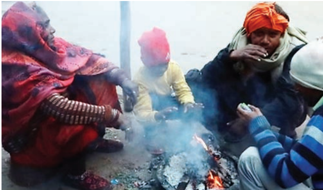
(KGMU) in Lucknow said, "Heart attacks in this cold weather are not restricted only to the elderly. We have cases when even teenagers have suffered heart attacks. Everyone, irrespective of age, should keep warm and stay indoors as much as possible." Meanwhile, Residents of Delhi woke up to cold morning on Friday with the minimum temperature recorded at 4 degrees Celsius, while the India Meteorological Department (IMD) has warned that cold wave conditions are likely to remain for another 24 hours in

The cold wave in Uttar Pradesh is turning deadlier by the day. In Kanpur, on Thursday, 25 persons died due to heart attack and brain stroke. Seventeen of these died even before they could be given any medical aid. According to doctors, the sudden increase in blood pressure in the cold and blood clotting is causing heart attack and brain attack. According to the control room of the Cardiology Institute, 723 heart patients came to the emergency and OPD on Thursday. Of these, 41 patients who were in critical condition, were admitted. Seven heart patients undergoing treatment at the hospital in critical condition died due to cold. Apart from this, 15 patients were brought to emergency in a brought dead condition. Professor Vinay Krishna, director of cardiology, said that patients should be protected from cold in this weather. A faculty member in the King George's Medical University