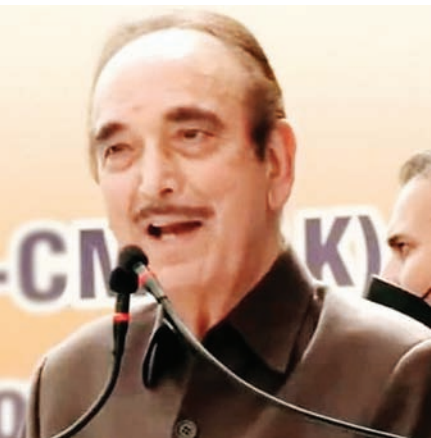
On December 30, the former Jammu and Kashmir Chief Minister Ghulam Nabi Azad rejected the reports about his rejoining the Congress as "completely baseless" and alleged this was to demoralise his party workers. Expressing "shock" at the reports in a section of media in this regard, Azad, in a tweet, said: "... Unfortunately such stories are being planted by a section of leaders in the congress party right now and are doing this just to demoralise my leaders and supporters. "I don't have any ill will against congress party and its leadership, however I request them to tell these habitual story planters to refrain from doing so."