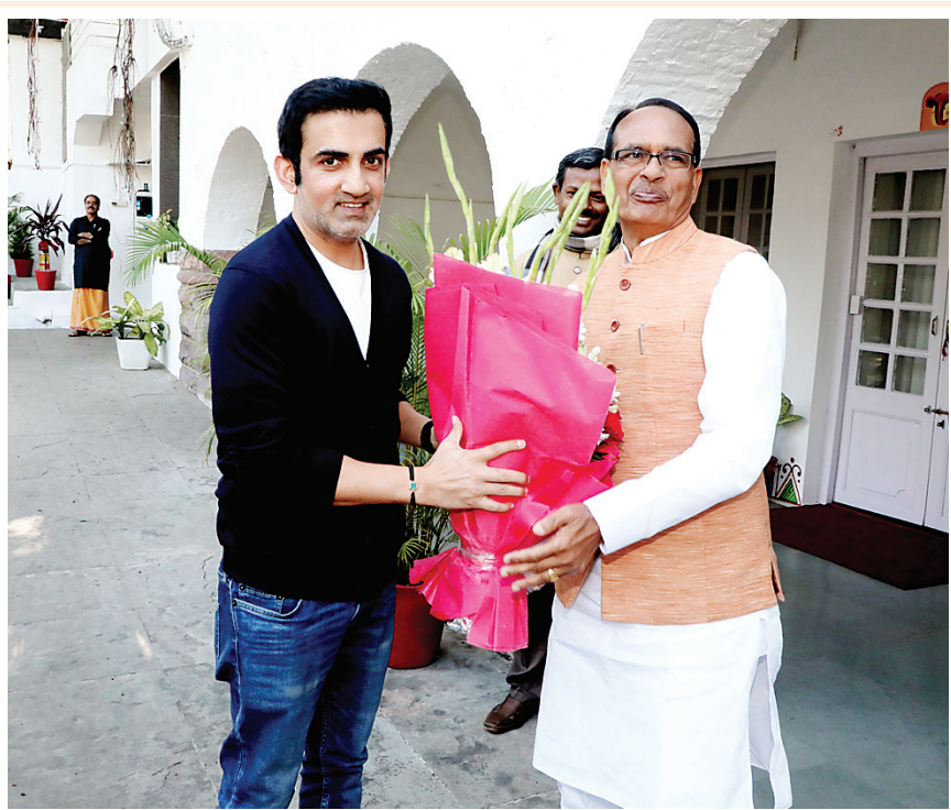
CM Shivraj Singh Chouhan was called on by international cricketer and Member of Parliament, Padmashri Gautam Gambhir at the Chief Minister Residence during his stay in Madhya Pradesh. Chief Minister Chouhan welcomed former Indian cricket team captain Gambhir.

state would have been waived by now." Nath assured that the loan of farmers would be waived if Congress returns to power in the state. "There is nothing to worry about. As soon as the Congress government is formed next year, this order will be issued again and the loan of each and every farmer brother will be waived," he said in another tweet. Reacting to Nath's tweets, MP Home Minister Narottam Mishra, who is also the spokesperson of the Shivraj Singh Chouhan-led Bharatiya Janata Party (BJP) government in the state, termed this announcement as "cheating". "Not a single farmer got the benefit of farm loan waiver of up to ₹ 2 lakh as stated in the order (posted by Nath). This is cheating. This tweet is rubbing salt into the wounds of farmers, who have become defaulters due to this promise," Mishra said.