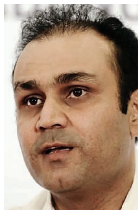
what kind of pitches are needed. Had it happened in India, it would have been labelled the end of Test cricket, ruining Test cricket and

"142 overs and not even lasting 2 days and they have the audacity to lecture on