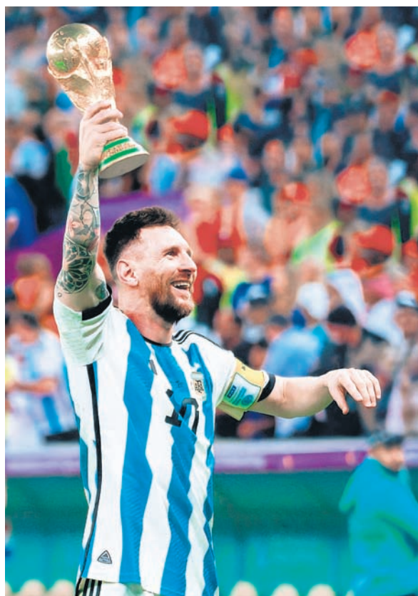
four-pass counter-attack as Alexis Mac Allister's cutback found Angel Di Maria and he finished well. Argentina star Lionel

France had come from two goals down to level over 90 minutes with Kylian Mbappe netting twice in two minutes, including an 80th-minute penalty. The France striker completed his hat-trick in the 118th with another spot-kick after Argentina's Lionel Messi had tapped in for a 3-2 lead in the 109th. Argentina had gone 2-0 up in the first half with Messi, making a record-breaking 26th World Cup appearance, converting a 23rd-minute penalty. They struck again with a sublime