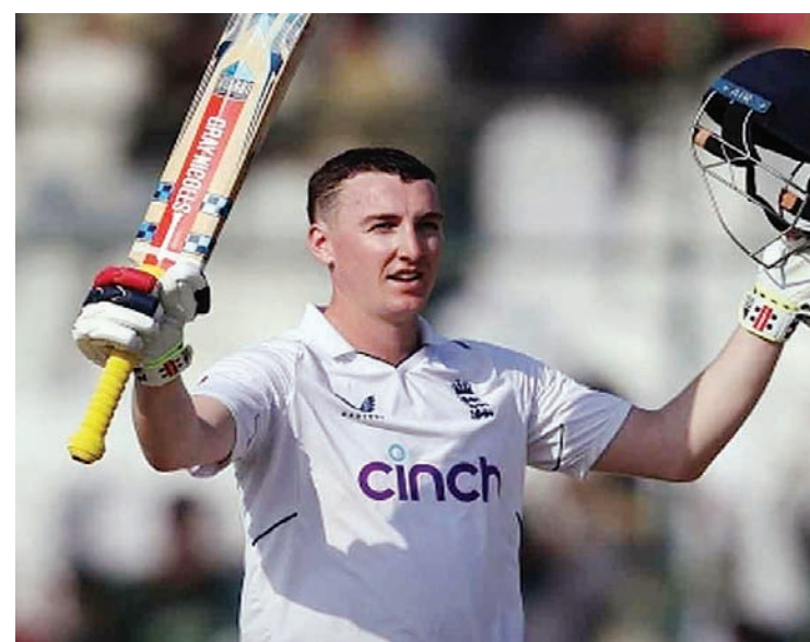
innings. After Pakistan's spinners knocked

Brook's 111 revived England's chances of becoming the first team ever to clinch a 3-0 series sweep in Pakistan after the visitors were teetering at 145-5. The middle-order batter rescued the visitors with a superb