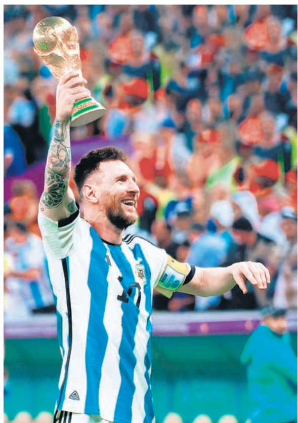
four-pass counter-attack as Alexis Mac Allister's cutback found Angel Di Maria and he finished well. Argentina star Lionel

France had come from two goals down to level over 90 minutes with Kylian Mbappe netting twice in two minutes, including an 80th-minute penalty. The France striker completed his hat-trick in the 118th with another spot-kick after Argentina's Lionel Messi had tapped in for a 3-2 lead in the 109th. Argentina had gone 2-0 up in the first half with Messi, making a record-breaking 26th World Cup appearance, converting a 23rd-minute penalty. They struck again with a sublime