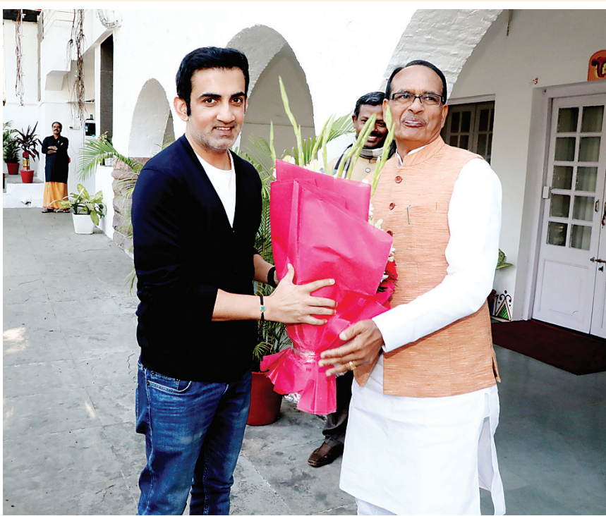
CM Shivraj Singh Chouhan was called on by international cricketer and Member of Parliament, Padmashri Gautam Gambhir at the Chief Minister Residence during his stay in Madhya Pradesh. Chief Minister Chouhan welcomed former Indian cricket team captain Gambhir.

"I believe that at least medical students would not do it. Students, even those doing MBBS courses in Hindi, should improve their English otherwise they will face problems. Because, it is totally a research-based study and the entire research and books are in English," said a professor, requesting not to be named.