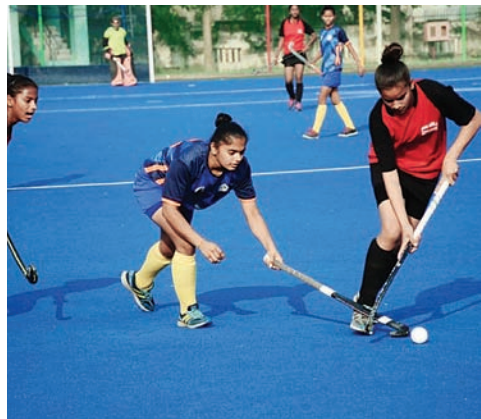
scoring to complete an 11-goal victory over Smart Hockey Academy, Raipur.