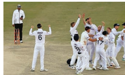
Pakistan miss out. Pakistan's loss also puts India in control to reach the WTC final given that they can now secure their place even if they lose one of the Tests against Australia at home, provided they sweep Bangladesh, reports ICC. If Australia win the remaining Test against West Indies and at least two Tests against South Africa, they would still be well placed to make the final.

P akistan's 74-run loss to Ben Stokes' England in the opening Test here on Monday has severely jeopardised the hosts' chances of securing a World Test Championship (WTC) final berth. Pakistan were placed fifth in the ICC World Test Championship standings, but had a realistic chance of making the final because of the five home Tests against England and New Zealand. However, a below-par performance on the final day at the Rawalpindi Cricket Stadium saw them lose their position of strength. While England are virtually out of contention to reach the WTC final, the loss is a significant blow to Pakistan. Wins for Australia and India in their respective series' would see