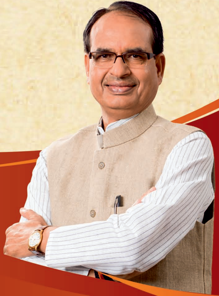
शिवराज सिंह चौहान, मुख्यमंत्री