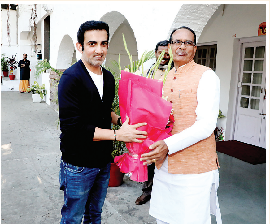
CM Shivraj Singh Chouhan was called on by international cricketer and Member of Parliament, Padmashri Gautam Gambhir at the Chief Minister Residence during his stay in Madhya Pradesh.

state would have been waived by now." Nath assured that the loan of farmers would be waived if Congress returns to power in the state.