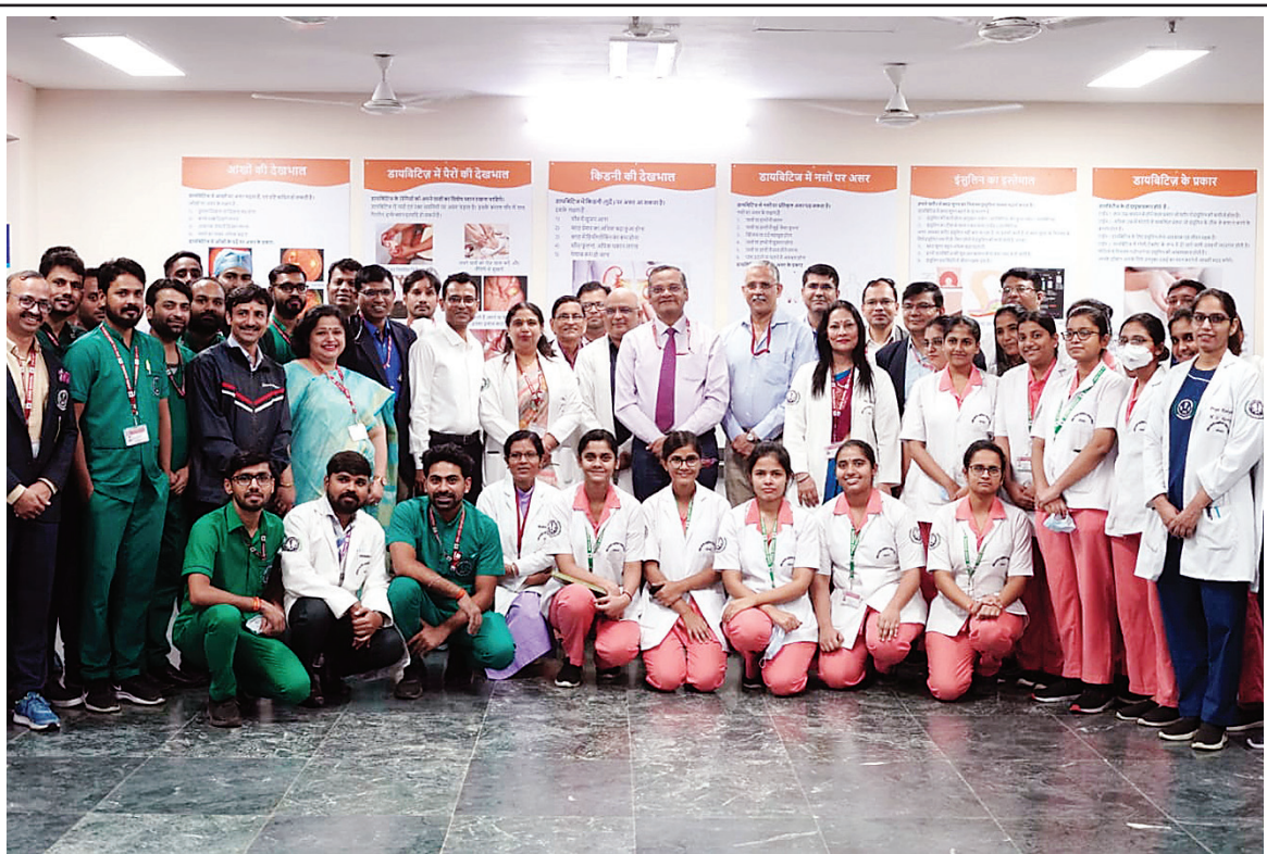
AIIMS Bhopal released educational material on the occasion of World diabetes day

It is to be known that the Congress government had fallen only because the Congress MLAs left the Congress under the leadership of Union Minister Jyotiraditya Scindia and joined the BJP.