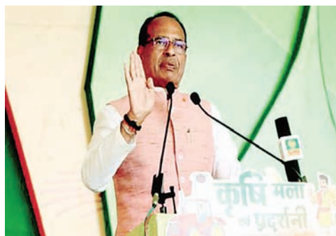
Chief Minister said that while on the one hand Prime Minister Shri Modi gives Rs 6000 to small

Chief Minister Shivraj Singh Chouhan has said that for the fulfillment of Prime Minister Narendra Modi's resolve to double the income of farmers, production will also have to be increased and the cost will have to be reduced. In this direction, while the Madhya Pradesh government is continuously increasing the area under irrigation, on the other hand, loans are being provided to the farmers at zero percent interest. Today's Krishi Mela will prove to be lucky for the farmers. Chief Minister Chouhan was addressing the inauguration programme of three-day 'Krishi Mela and Exhibition' in Morena district.