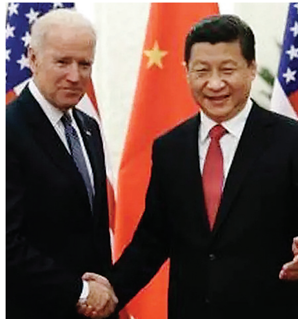
ing for competition, not conflict". The President also said he would want to understand from Xi "what each of our red lines are, what he believes to

Washington | Agencies In an address to the media, US President Joe Biden has confirmed that he will meet his Chinese counterpart Xi Jinping on November 14 in Bali during which Taiwan is expected to top the agenda. The meeting in Bali on the sidelines of the G20 summit will be the first between the two leaders since Biden took office in January 2021, according to the White House. When asked at the press briefing if he was committed to defending Taiwan militarily and willing to make any concessions, Biden said: "I'm not willing to make any fundamental concessions." Referring to when he was Vice President in the former Barack Obama administration, Biden said that he "met with him (Xi) many times.... And I've told him: I'm look-