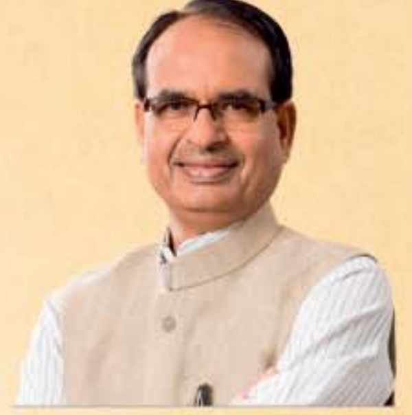
शिवराज सिंह चौहान, मुख्यमंत्री