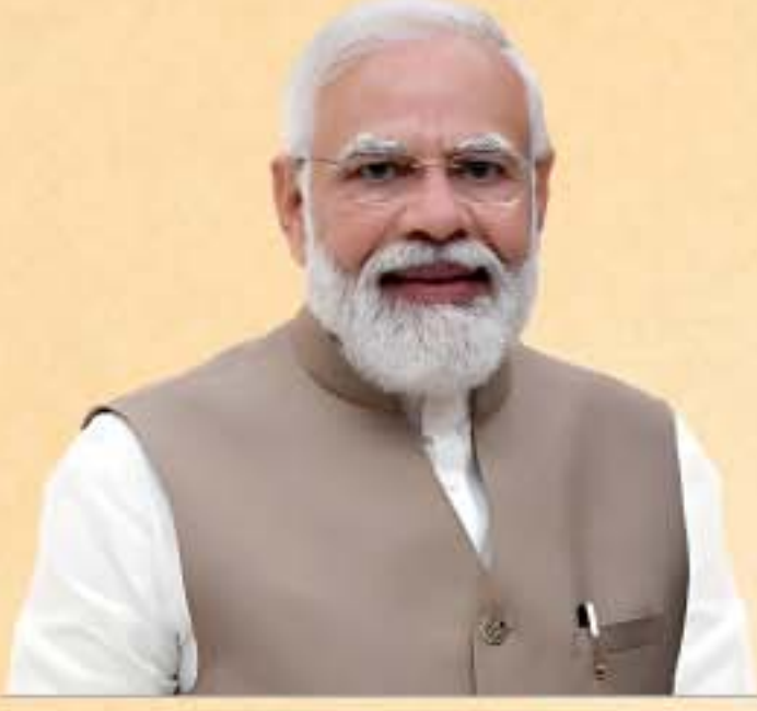
नरेन्द्र मोदी, प्रधानमंत्री