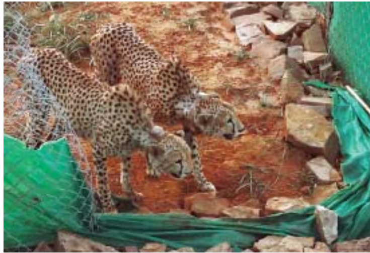
The development came after the officials at the Kuno National Park held another round of meeting with

Officials monitoring the daily movement and the health condition of the Namibian cheetahs at their new habitat at Kuno, said that one more big cat will be released into a larger enclosure by Sunday evening.