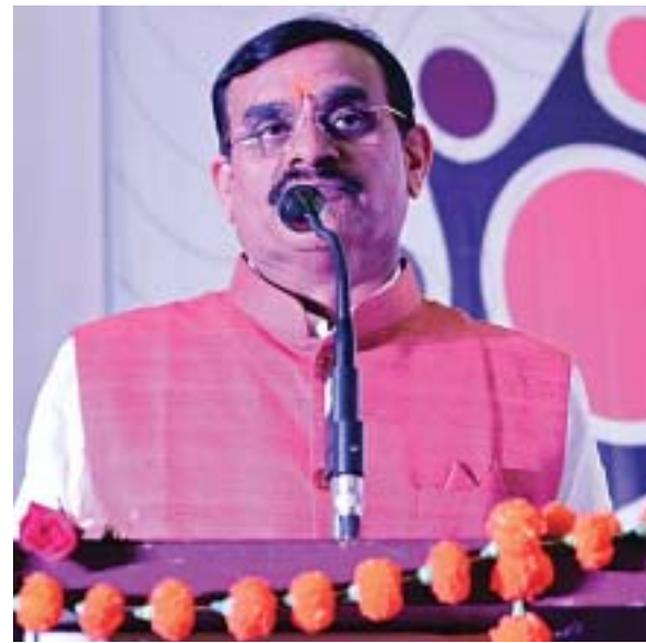
He had also played a crucial role during the inauguration of newly-developed 'Mahakal Lok' in Ujjain, and hundreds of NRIs had witnessed the inauguration live when it was

Political observers and BJP sources claim there are marginal chances that the party would replace Sharma, especially when the elections are just few months away. Speculation about the change had gained momentum after Sharma was included in the BJP's advisory committee on foreign issues.