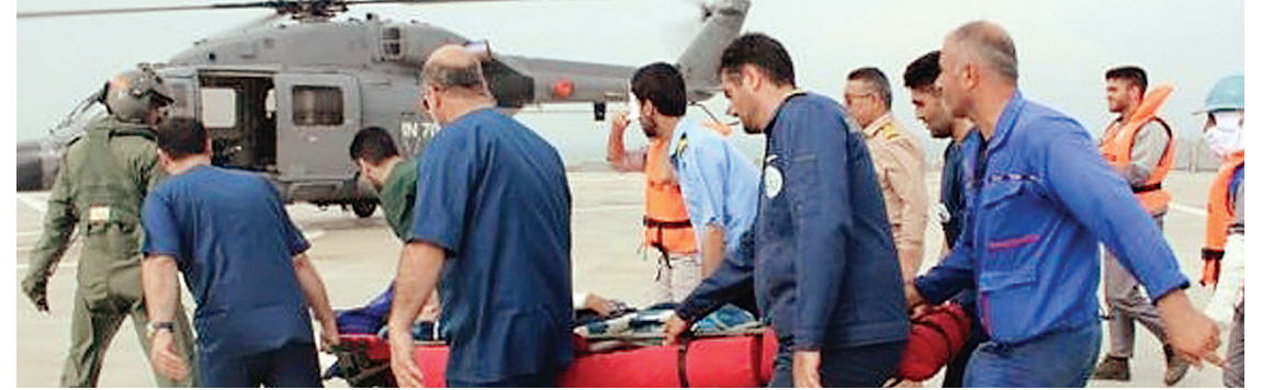
with two attendants. They were directly airlifted to the Navy hospital, INHS Asvini by 9.50 a.m., in less than 90 minutes, and the officer admitted for treatment.

At around 8.30 a.m., the Iranian Navy requested medical evacuation of its Navy officer who had suffered a cardiac arrest onboard IRI Ship Makaran, off the Mumbai coast. The Indian Navy helicopter from INS Shikra flew to the vessel and evacuated the patient along-