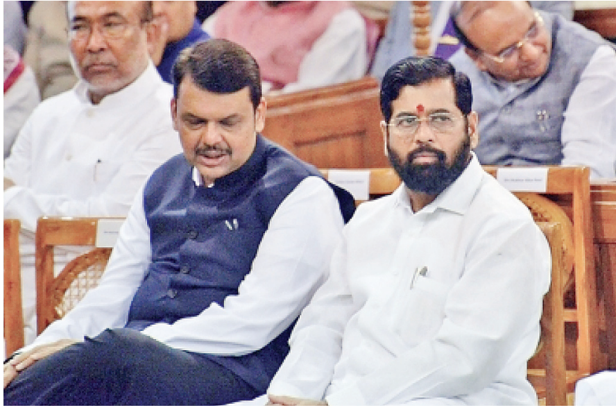
Uddhav Thackeray and Eknath Shinde.

Accordingly, the police have charged them under various sections of Indian Penal Code for inflammatory speech, using objectionable language, attempts to incite passions and sul-