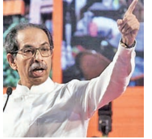
Uddhav Thackeray speaking.

On Wednesday, addressing his party workers from Uran in neighbouring Raigad district, Thackeray said their organisation will