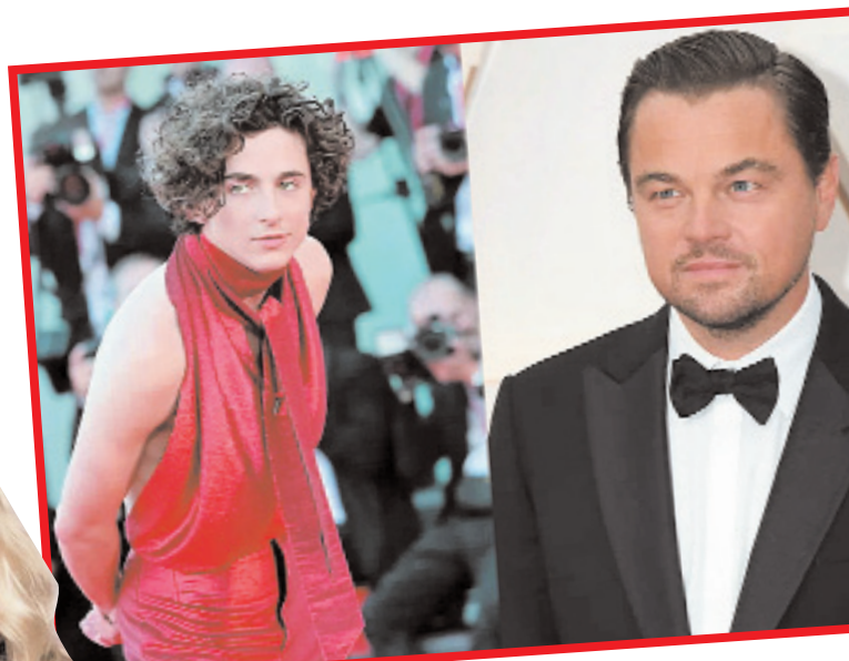
Los Angeles | Agencies

DiCaprio advises Timothee Chalamet against starring in superhero movies