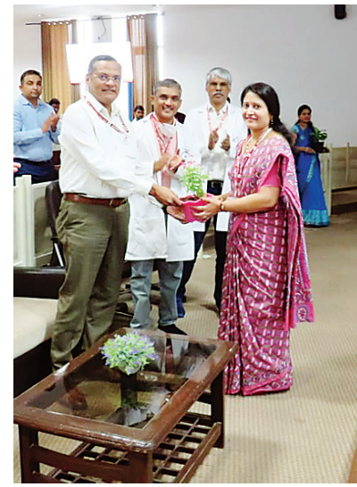
of yoga and naturopathy in PCOS management.