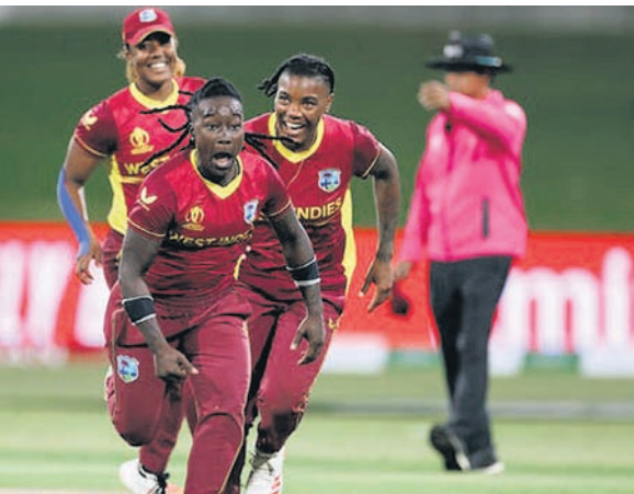
Mount Maunganui | Agencies

A superb all-round display from West Indies' dependable player Hayley Matthews -- 119 off 128 balls and 2/41 -- helped the side score a nerve-racking three-run victory over hosts New Zealand in the opening match of the ICC Women's World Cup at the Bay Oval here on Friday.