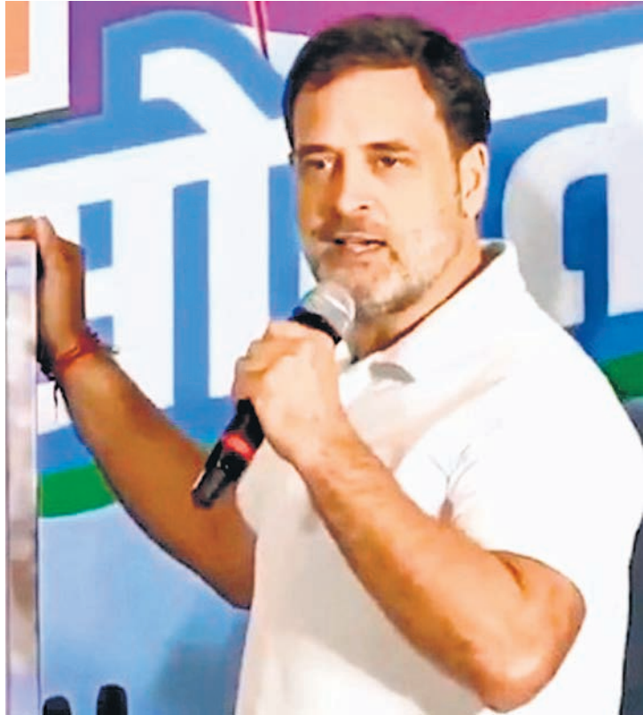
The Congress bigwig reiterated the Maha Vikas Aghadi (MVA) Manifesto -- released on November 10, and inspired by Chhatrapati Shivaji

Speaking to media persons on the final day of the polls campaign, he said that the problems of the masses with their shattered dreams would weigh on the minds of the voters on Wednesday.