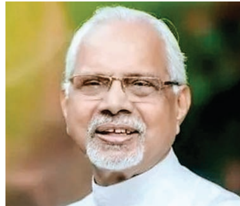
format that took him over 13 years from 1997 to complete, which became an instant best-seller with over three reprints.