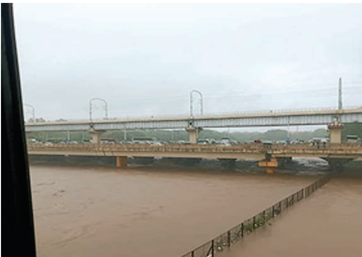
"The units of NDRF, SDRF, Army, Navy, Police, Fire Brigade, Health System have been directed to coordinate with each other and lend help,"