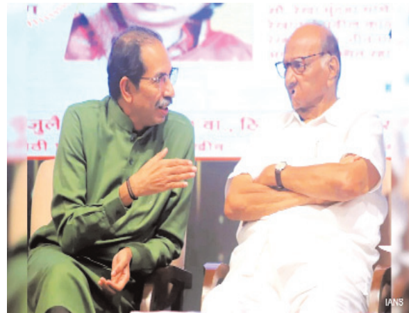
Uddhav Thackeray saying he had already become "Congress-minded", Fadnavis said it showed how difficult it was for Sharad Pawar himself to manage his party. Speaking at an election rally in Pune district, Uddhav Thackeray said Eknath Shinde and Devendra

Earlier, in an interview to The Indian Express, Sharad Pawar predicted that in the next couple of years, several regional parties will associate more closely with the Congress, or even merge with it. While chief minister Shinde latched on to Sharad Pawar's comment to target