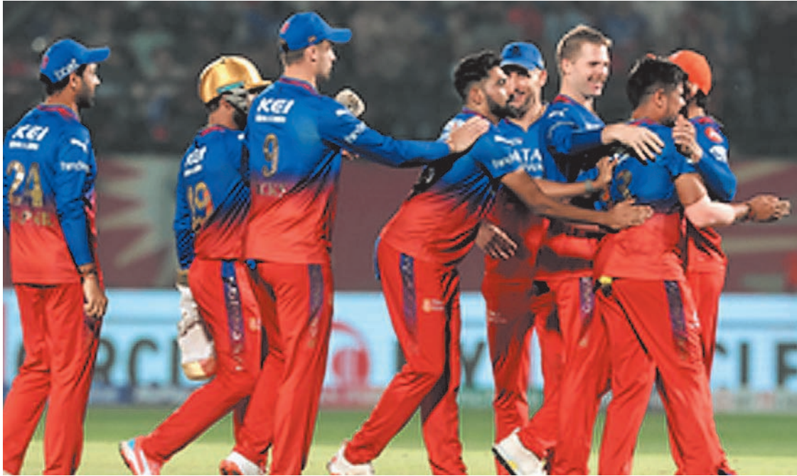
a six over Cameron Green's head. After getting some attention from the physio for an injury, Rossouw holed out to long off against Karn Sharma, who went on to castle Jitesh Sharma.