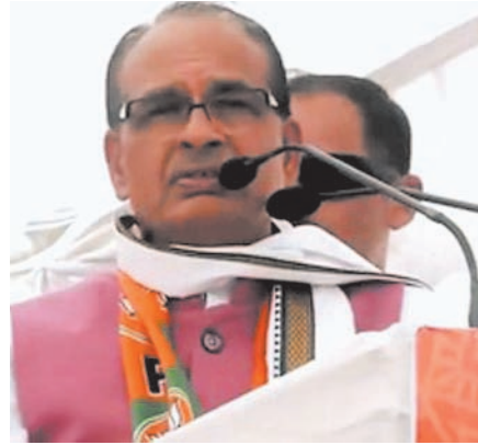
campaign. Usually, when a leader contests elections, they ask for money, but I am such a lucky brother, who has for this, the sisters are collecting money from their hard-earned money and donating it to contest the elections.

He said that he will keep the sack of wheat here and after winning the elections, a banquet will be held here, in which I will also come. My sisters are taking out money from their pallu and giving it to me and saying, brother, this is 10 rupees for your election