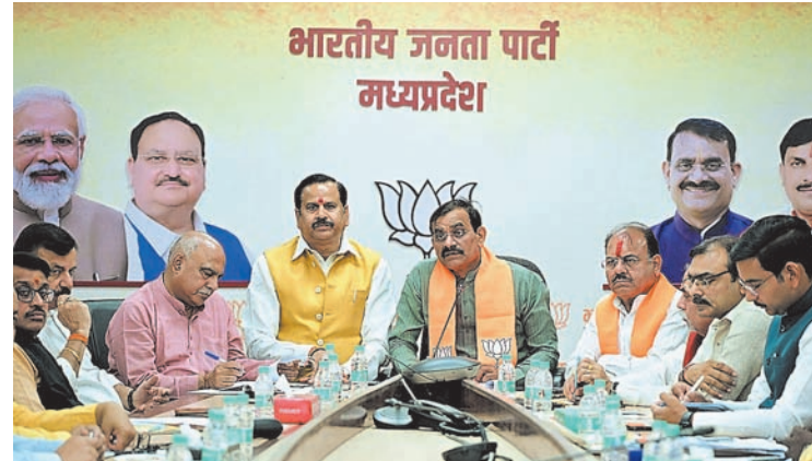
time. Panna Pramukhs will play a big role in getting maximum number of votes in the upcoming two phases of elections.

State President of Bharatiya Janata Party and Khajuraho MP Vishnudatt Sharma, while addressing the meeting of Lok Sabha Election Management Team at the BJP State Office on Thursday, said that the Election Management Team including BJP workers, regarding the completion of two phases of Lok Sabha voting in the state, Have done better work. We have to do better work in the two phases of Lok Sabha elections on 7th and 13th May. He said that by winning all the 29 Lok Sabha seats of the state with an overwhelming majority, we have to strengthen the hands of Prime Minister Narendra Modi by making him the Prime Minister for the third