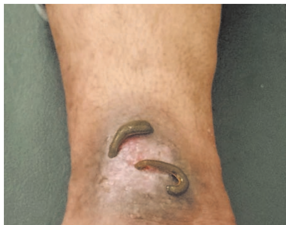
impurities from the blood. Emphasizing the benefits of these traditional treatments, the Unani Medical Officer at AIIMS Bhopal said, "Cupping and leech therapy provide natural and effective solutions to many health problems including pain management, inflammation and detoxification."

These ancient therapeutic techniques have been practiced for centuries and are now gaining recognition for their holistic approach towards treatment. Cupping therapy involves placing cups on the skin to create suction, promote blood flow, and reduce muscle tension. This therapy treats joint pain, arthritis, skin diseases like; Effective in ringworm, eczema, and acne. Similarly, leech therapy is used to treat various diseases like; Psoriasis, Varicose Veins, Non-healing ulcers, Alopecia etc. This medical system uses medicinal leeches to remove