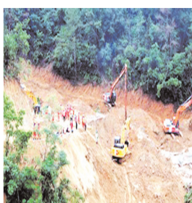
The Ministry of Emergency Management has dispatched a team to the

Guangzhou | Agencies The death toll from the collapse of a portion of a road in China's Guangdong province has risen to 48, authorities said. Thirty injured people are receiving hospital treatment, and none are in life-threatening condition, according to authorities of Meizhou City, Xinhua news agency reported. The collapse happened around 2.10 a.m. on the Meizhou-Dabu Expressway in Meizhou. The collapsed section measures 17.9 meters in length and covers an area of 184.3 square meters, officials said. Aerial photos show one side of the expressway had caved in, causing vehicles to roll down a slope. The Ministry of Emergency Management has dispatched a team to the