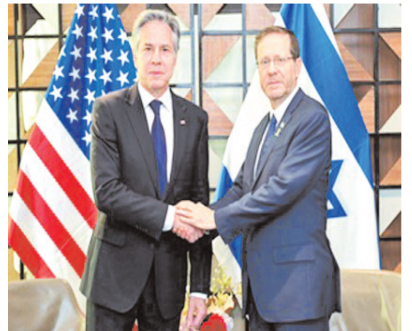
Blinken had previously spoken of a "very, very generous" proposal from Israel for a deal with Hamas. As part of mediation efforts in Cairo, a response from Hamas is now being awaited.

Tel Aviv | Agencies U S Secretary of State Antony Blinken met Israeli President Isaac Herzog in Tel Aviv on Wednesday at the start of a fresh round of talks aimed at bringing about a ceasefire in the Gaza war. The release of the hostages held by the Palestinian Islamist Hamas movement was currently a top priority, Herzog said at the meeting, according to his office. "We're determined to get a ceasefire that brings the hostages home, and to get it now. And the only reason that that wouldn't be achieved is because of Hamas," Blinken said. Blinken said there was a proposal on the table: "And as we've said, no delays, no excuses. The time is now." "At the same time, even as we're working with relentless determination to get the ceasefire that brings the hostages home, we also have to be focused on people in Gaza who are suffering in this crossfire of Hamas's making, and so focused on getting them the assistance they need - the food, medicine, the water, the shelter - is also very much on our minds and in the work that we're doing." Blinken said he planned to discuss these issues with Herzog. A meeting with Israeli Prime Minister Benjamin Netanyahu is planned for later in Jerusalem.