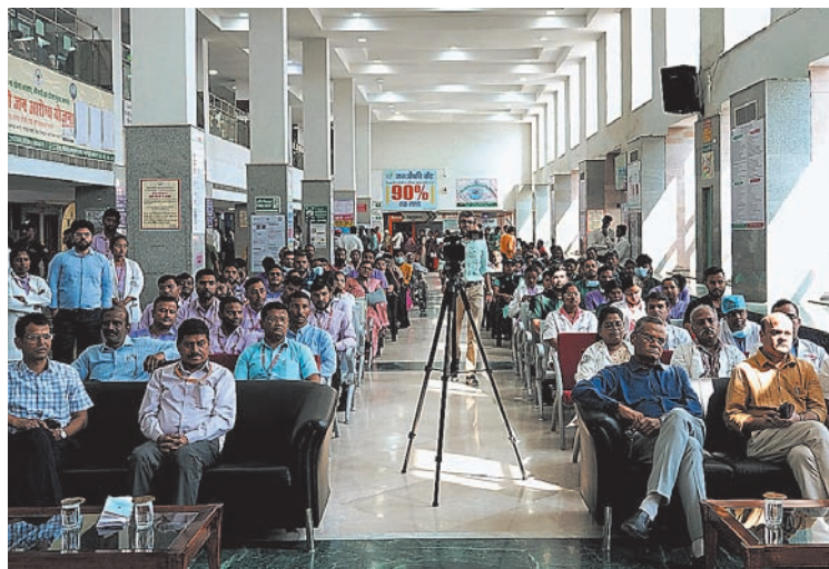
friends, and family members. The captivating Nukkad-Natak focused on Hand Hygiene awareness, skillfully blending education with