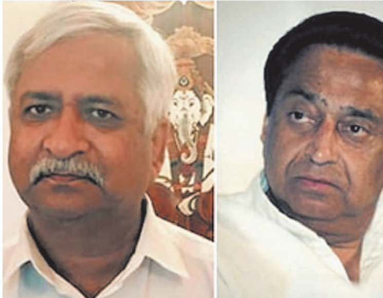
with a woman.