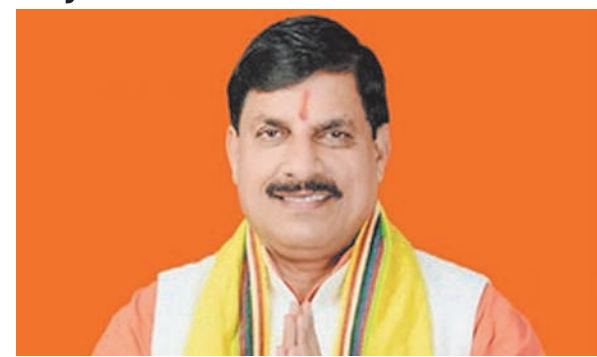
Team Absolute | Bhopal

India is likely to witness rainfall above the normal level this monsoon, the weather department has said. Sharing the forecast, the India Meteorological Department said the country will receive cumulative rainfall estimated at 106 per cent of long-period average of 87 cm.