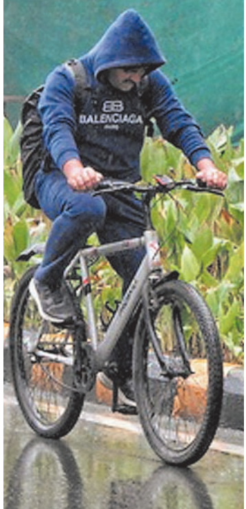
(87 cm), he said. Positive Indian Ocean Dipole conditions are predicted during the monsoon season.

India is likely to see above-normal rainfall in the four-month monsoon season (June to September) with cumulative rainfall estimated at 106 per cent of the long-period average