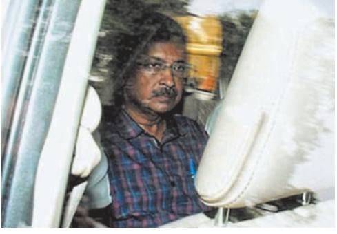
ic constipation and cough (chronic bronchitis), who is under regular treatment," the ED counsel said.

The Enforcement Directorate (ED) alleged in a Delhi court on Thursday that Chief Minister Arvind Kejriwal is deliberately eating mangoes and other high-carb food in Tihar Jail to raise his blood sugar level to build a case for bail.