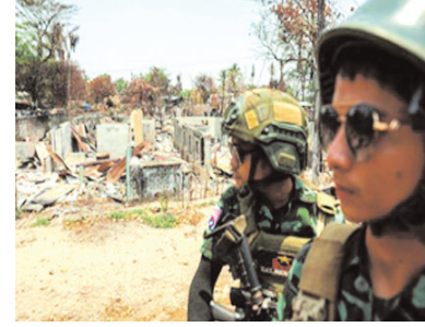
junta shortly after the military coup in February 2021. As recently as Wednesday, the Chinland Defence Force celebrated the third

Bangkok | Agencies Several civilians were killed and many more injured in a heavy airstrike by the military in Myanmar on a rebel-controlled region on the border with India. The bombs hit a hospital in the town of Mindat in the state of China in the west of the crisis-torn country on Thursday evening, eyewitnesses and local media reported on Friday. At least four people died at Wanma Thu District Hospital, and 15 others were seriously injured, a man who helped rescue the victims and spoke on condition of anonymity told dpa. In the region, rebels began resisting the