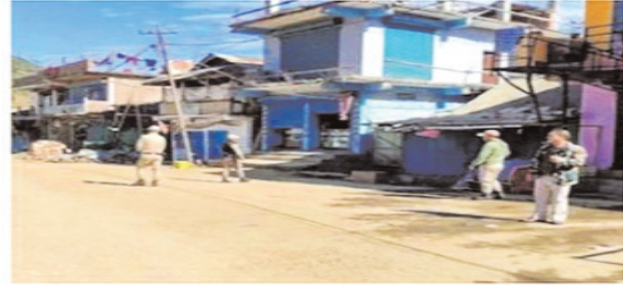
Manipur seat in 2019 while Naga People's Front (NPF) leader Lorho S Ploze represents the Outer Manipur constituency.

Union Minister of State for External Affairs and Education Rajkumar Ranjan Singh of the ruling BJP won from the Inner