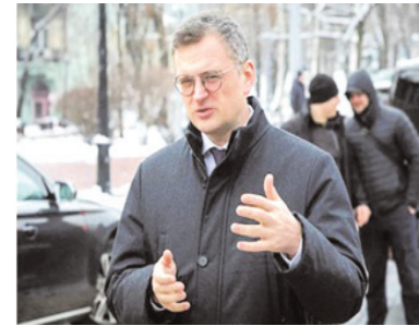
for its initiative to purchase artillery ammunition for Ukraine and appreciated the

countries that have joined the initiative.