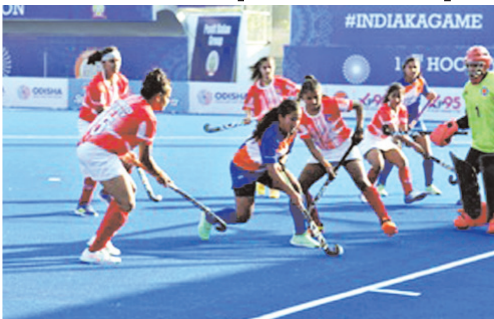
from set pieces to secure the draw. In another Pool G match of the day, Hockey Karnataka spanked Dadra & Nagar Haveli and Daman and Diu Hockey 13-0.