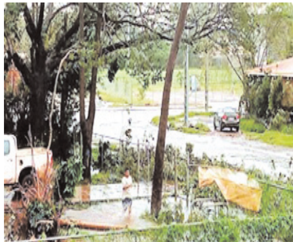
"There are enough buildings in Borroloola that are rated to withstand a category 3 cyclone to keep the community safe."

"We're working with the local emergency management team to keep the community safe," she added.