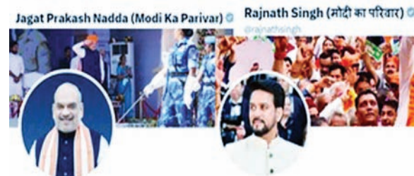
Amit Shah (Modi Ka Parivar) Anurag Thakur (मोदी का परिवार)