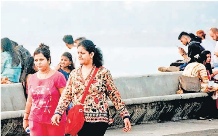
northwesterly winds blow, the temperature in the city lowers.

The temperature dip in the city can be attributed to the northwesterly to westerly winds prevailing over the region, per the India Meteorological Department. An official from the weather bureau noted that when