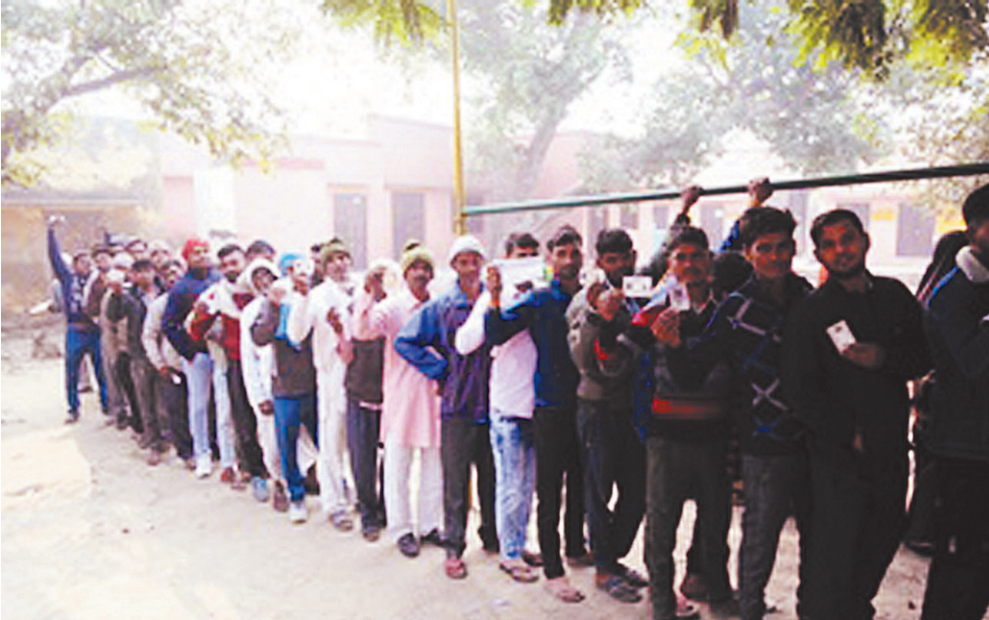
13th May, voting will be held in eight parliamentary constituencies. At present there are 5 crore 64 lakh 76 thousand 110 voters in Madhya Pradesh. This

Whereas in the second phase, voting will be held in seven parliamentary constituencies on 26th April, in the third phase in eight parliamentary constituencies on 7th May and in the fourth phase on