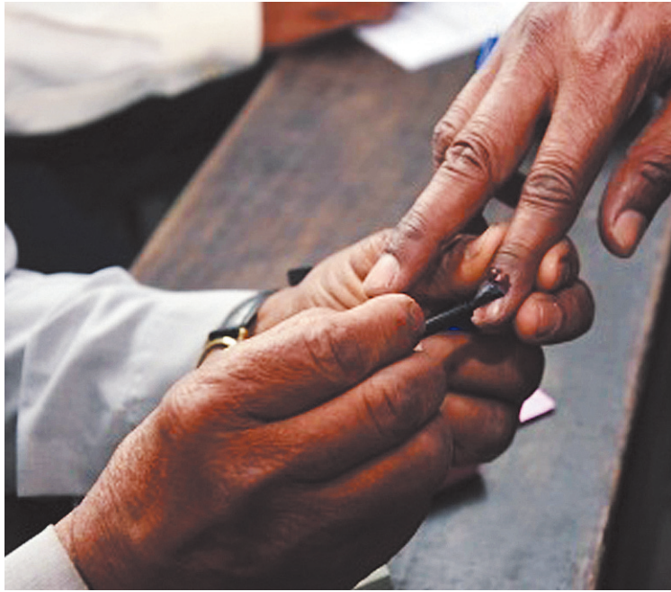
serving in army and other central forces, while 118 are overseas voters.