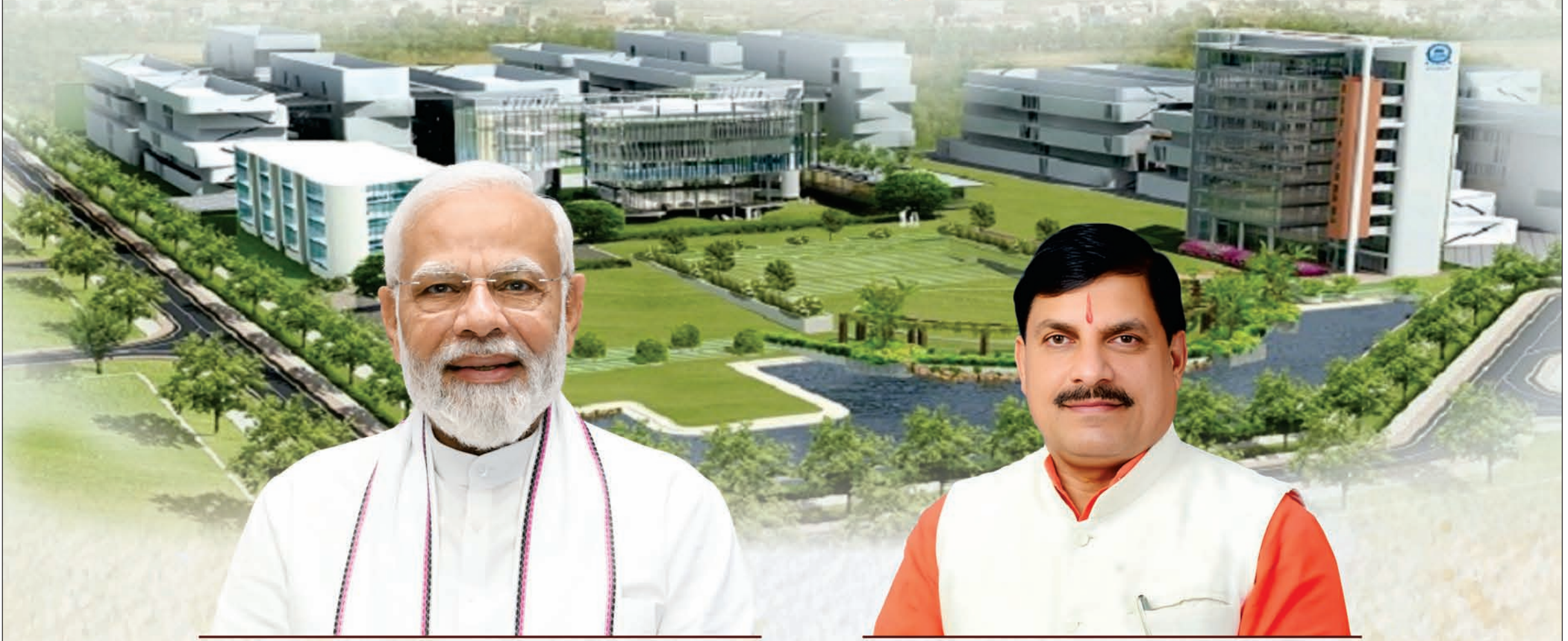
नरेन्द्र मोदी, प्रधानमंत्री