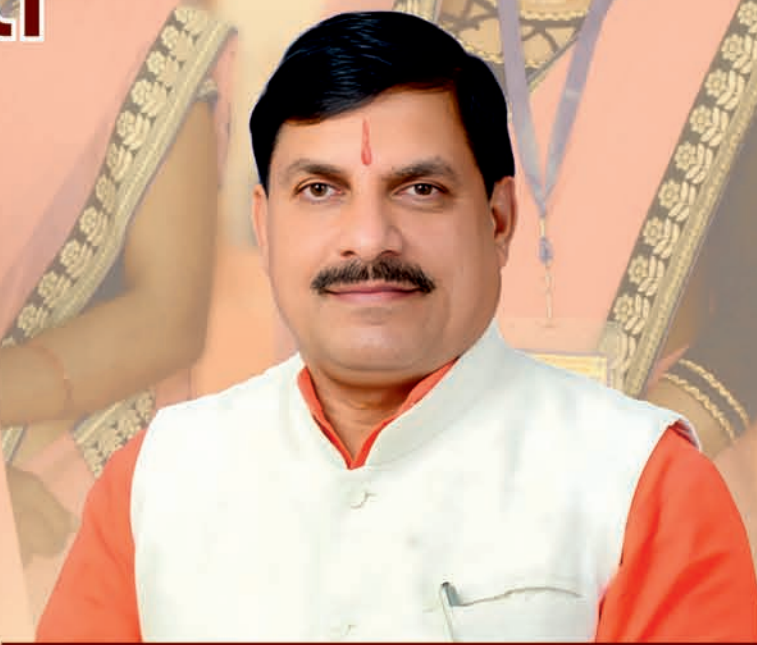
डॉ. मोहन यादव, मुख्यमंत्री