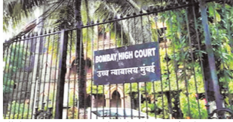
till the Supreme Court decides the state's plea against the verdict, if it is challenged.