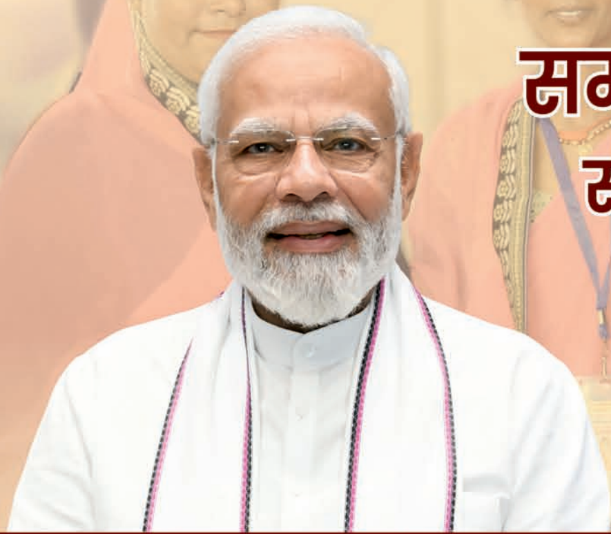
नरेन्द्र मोदी, प्रधानमंत्री