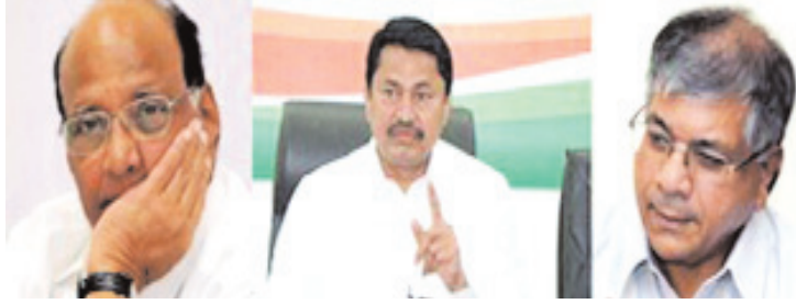
'unacceptable' to several MVA constituents.

The VBA stumped the Opposition bloc last week by seeking at least 27 parliamentary seats, plus a unilateral choice of its candidates in certain constituencies, which was reportedly