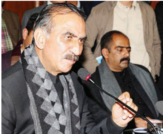
Force (CRPF) and Haryana Police, reached Shimla by helicopter but abstained themselves from the House

"Six rebel MLAs, escorted by the Central Reserve Police