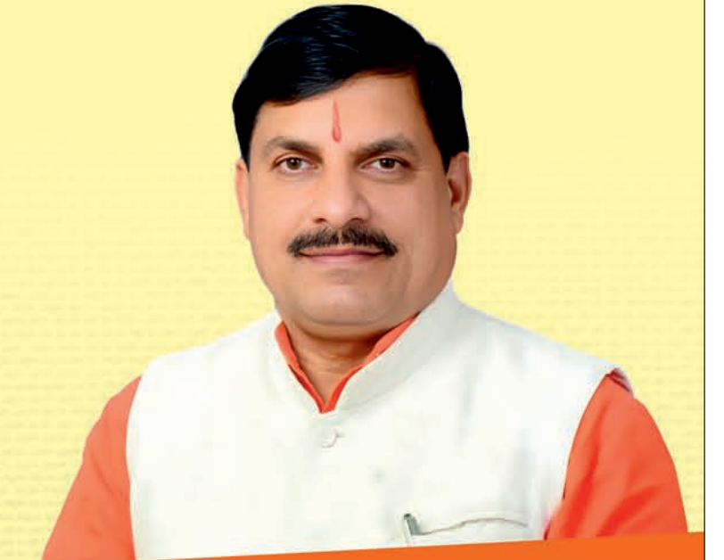
डॉ. मोहन यादव, मुख्यमंत्री

2 मार्च 2024 - दोपहर 12:30 बजे - शासकीय इंजीनियरिंग कॉलेज, उज्जैन