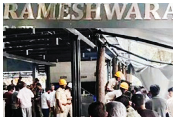
Karnataka Deputy Chief Minister D.K. Shivakumar on Friday said that the identity of the man suspected to be behind the blast at a cafe here has been traced, adding the accused would be arrested "in a few hours". Chief Minister Siddaramaiah had earlier said that the blast that occurred at the Rameshwaram Cafe in Bengaluru's IT hub Whitefield on Friday was due to an improvised explosive device

the customers were IT professionals as the cafe is located in the Kundalahalli Gate area near Indiranagar, considered as an IT corridor, sources said. The police have recovered nuts, and a bag carrying batteries from the spot. The authorities are also suspecting that the act could be a fallout of business rivalry. "We are not ruling out any