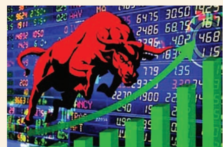
Prabhudas Lilladher, the Indian economy witnessed robust growth of 8.4 per cent in Q3FY24 as against 4.3 per cent in Q3FY23

Mumbai: The BSE Sensex gained a whopping 1,200 points on Friday on the back of a robust set of GDP numbers. The Sensex, which touched a fresh all-time high of 73,819.21 in intra-day trade, ended 1.72 per cent or 1,245.05 points higher at 73,745.35, while the Nifty closed at 22,338.75, up 355.95 points or 1.62 per cent. Among the Sensex stocks, Tata Steel gained a huge 6 per cent, while JSW Steel was up 4 per cent. L&T also gained 4 per cent, while Titan, Indusind Bank, Maruti, and ICICI gained 3 per cent each. As per a report by brokerage firm