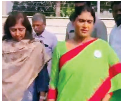
if she was suspected Jagan Mohan Reddy's involvement, she said: "I can't say if his role is there or not. It is for the CBI to probe. His name has come up, probe it. If there is involvement, make it public and if not, leave him. I am not here to say whether they did or not. It is for the CBI. They have to complete the investigation."

Replying to a query, she alleged that Jagan Mohan Reddy is shielding Y.S. Bhaskar Reddy - her father's cousin - and his son and Kadapa MP Y.S. Avinash Reddy, who are accused in the case. Asked