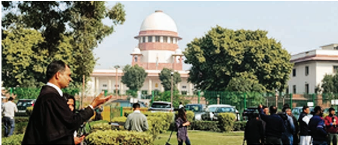
Act who represent opinions of people on making laws, plans and policies and post election, start behaving as rulers.

The petitioner, appearing in-person, contended that MPs and MLAs are salaried representatives under the Representation of the People