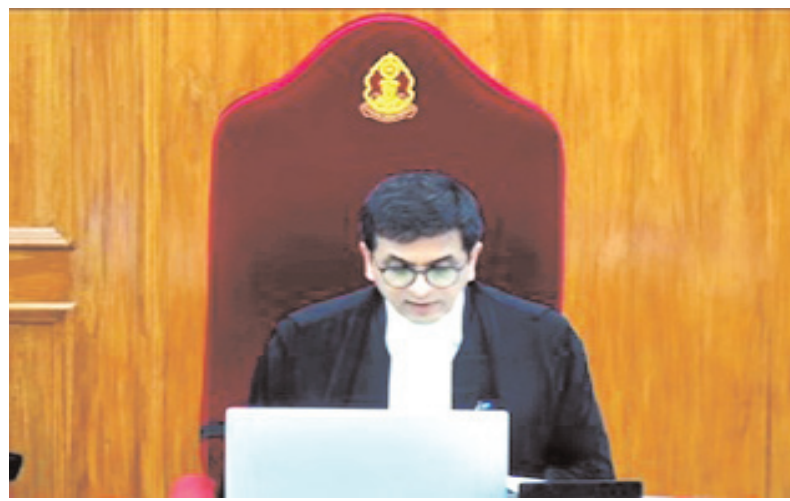
The Supreme Court had earlier issued a notice in the matter and called for the response of CM Shinde and 38 other MLAs within a period of two weeks.