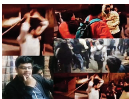
gations are being verified."