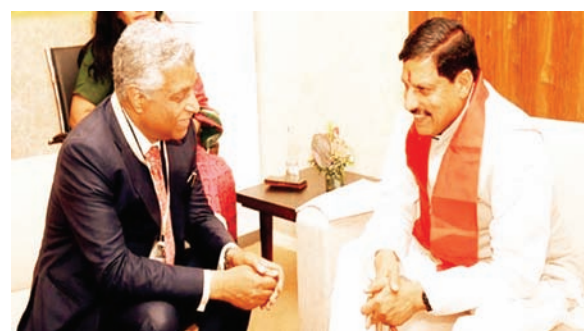
Team Absolute | Bhopal

India's Gross Domestic Product (GDP) growth is slated to attain a new peak, sectors like manufacturing and automobiles have started looking up again, and the GST collections are attaining new highs. All these indicators augur well for the country's growth and have also come as a major boost for the incumbent Narendra Modi government.