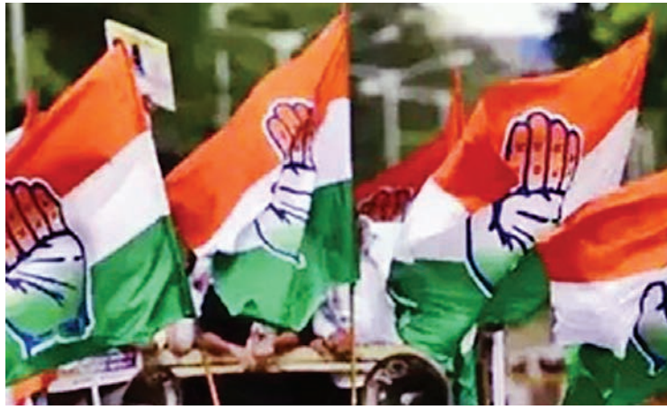
some Congress officials and workers joining BJP. Discussions about former Chief Minister Kamal Nath and his son Chhindwara MP Nakul Nath join-