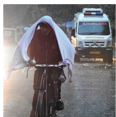
Gilgit, Baltistan, Muzaffarabad, Himachal Pradesh and Uttarakhand till February 5," it said. The IMD further predicted that isolated heavy rainfall/snowfall is also likely over Himachal Pradesh and Uttarakhand on Thursday while light/moderate scattered to fairly widespread rainfall is very likely over Punjab, Chandigarh, Haryana, Delhi and isolat-

The India Meteorological Department (IMD) on Thursday said that a wet spell over northwest India is likely to continue during next 24 hours, and thereafter another spell is likely to affect the region on Saturday and February 5. It further said that a Western Disturbance as a trough in middle tropospheric westerlies is running roughly along longitude 72 degrees east to the north of latitude 30 degrees north with an induced cyclonic circulation over northwest Rajasthan and neighbourhood in lower tropospheric level. "Another Western Disturbance is likely to affect northwest India from Saturday," the IMD said in its daily bulletin. "Under the influence of these systems, light/moderate fairly widespread to widespread rainfall/snowfall is very likely over Jammu, Kashmir, Ladakh,