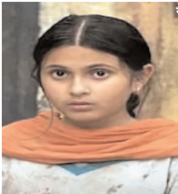
both the left and right sides of your body, and it gradually worsens, as explained by the Clinic.

According to the Mayo Clinic, the condition can affect both adults and children. Adults typically develop dermatomyositis between the late 40s and early 60s. It usually appears in children between the ages of five and 15. The condition affects more females than males. Dermatomyositis symptoms can appear suddenly or gradually. The most common signs and symptoms are skin changes and muscle weakness. Under skin changes, a violet-coloured or dusky red rash appears, usually on the face and eyelids, but also on the knuckles, elbows, knees, chest, and back. Dermatomyositis is frequently preceded by an itchy and painful rash. Progressive muscle weakness affects the muscles closest to the trunk, including the hips, thighs, shoulders, upper arms, and neck. The weakness affects