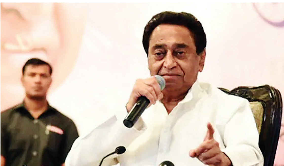
Team Absolute | New Delhi

The Congress has claimed that its veteran leader from Madhya Pradesh, Kamal Nath, is not joining the BJP. This is what Nath has told them when asked about the matter, party general secretary Jitendra Singh told news channel. Nath is in Delhi amid a buzz that he is joining the BJP, upset over his removal from the state party chief