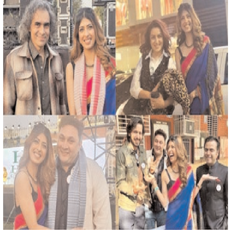
She played the role of Sonia, sister of

For the unversed, Aishwarya and Rajesh have shared the screen space in the sitcom 'Sarabhai vs Sarabhai Take 2'.