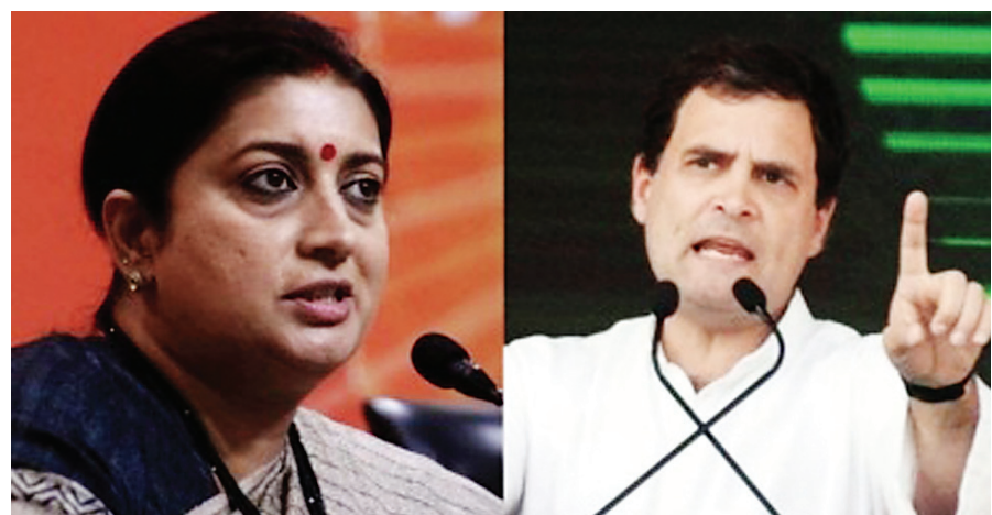
Team Absolute | New Delhi

Amethi Lok Sabha constituency, a traditional stronghold of the Gandhis, is all geared up for intense action and political