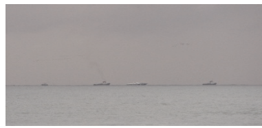
Ministry said the ship sustained critical holes on the left side as it was attacked by "MAGURA V5" combat sea drones, Xinhua news agency reported.

Separately, the Main Intelligence Directorate of the Ukrainian Defense