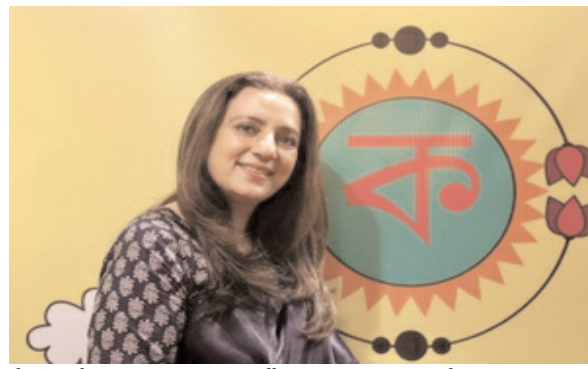
during the recent Apeejay Kolkata Literary Festival.

"While eating, all senses come into play. And it is also the associated memories that transport a dish into a different realm -- like how your mother would prepare and feed you a particular dish. All these senses create a sense of identity. So when we lose a dish, it is a major cultural loss. When we lost the heritage rice, we lost the aroma, the feel of the khichdi in winters and things that were a part of our cultural language because hybrids have taken over," she said