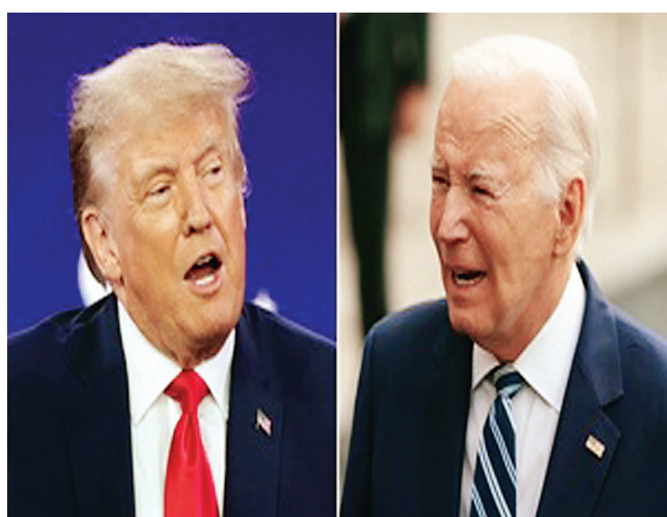
The former president's prodigious legal fees. Similarly, Trump's official campaign blew through more cash than it took in over the last three months of the year...