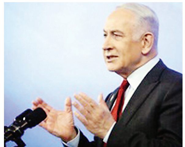
working on another outline for the release of hostages and that won't be at any cost. It may be noted that active mediatory talks are being held at various places between Qatar, Egypt and the US for the release of Israeli hostages...