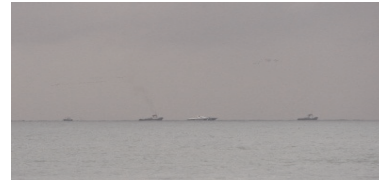
Ministry said the ship sustained critical holes on the left side as it was attacked by "MAGURA V5" combat sea drones, Xinhua news agency reported.

Separately, the Main Intelligence Directorate of the Ukrainian Defense