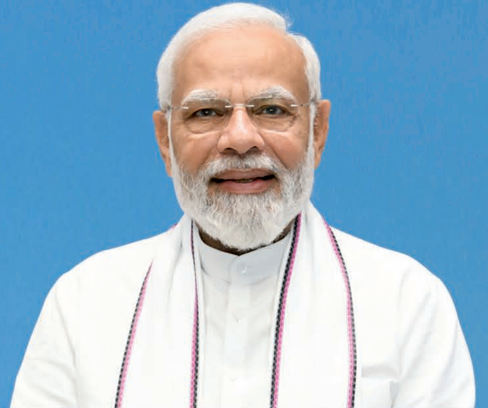
नरेन्द्र मोदी, प्रधानमंत्री