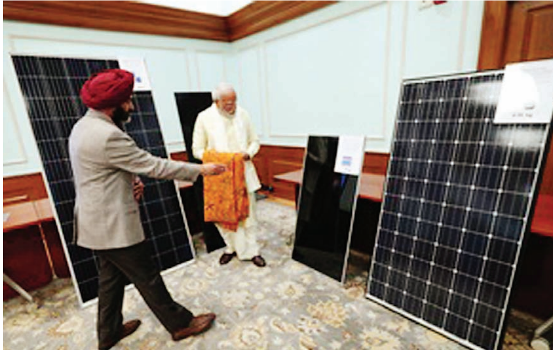
The Prime Minister also directed that a massive national cam-

During the meeting, the Prime Minister said that the power of the sun can be harnessed by every household with a roof to reduce their electricity bills and to make them truly Aatmanirbhar for their electricity needs. The Pradhanmantri Suryodaya Yojana aims to provide electricity to low and middle-income individuals through solar rooftop installations, along with offering additional income for surplus electricity generation.