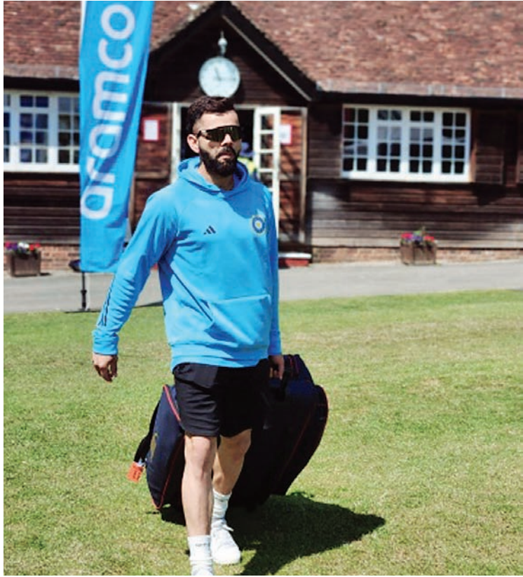
remain on supporting the Indian cricket team as they embark on the upcoming challenges in the Test series," said the BCCI.

"The BCCI respects his decision and the Board and team management has extended its support to the star batter and is confident in the abilities of the remaining squad members to step up and deliver commendable performances in the Test series." "The BCCI requests the media and fans to respect Virat Kohli's privacy during this time and refrain from speculating on the nature of his personal reasons. The focus should