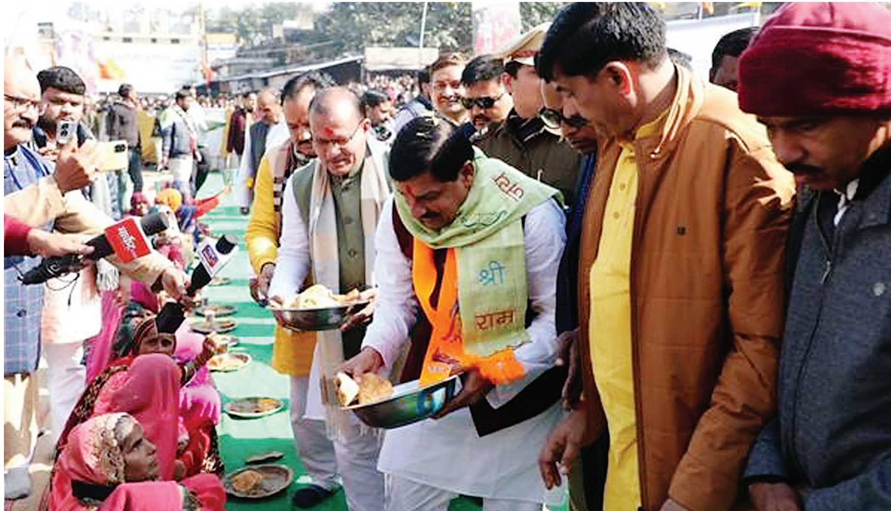
for Culture, Tourism and Endowments (Independent Charge) Shri Dharmendra Singh Lodhi, Chairman of Madhya Pradesh

A big LED screen was installed in the pandal built in the Shri Ramraja temple complex, on which the live telecast of the consecration ceremony of Shri Ramlalla was being performed. Among those present were Chief Minister Dr. Yadav, former Chief Minister Shri Shivraj Singh Chouhan, Minister of State