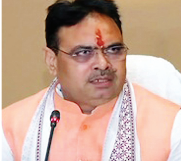
Government before the 'Prana Pratishtha' ceremony in Ayodhya late on Sunday night. The state government also

These announcements were made by the Rajasthan