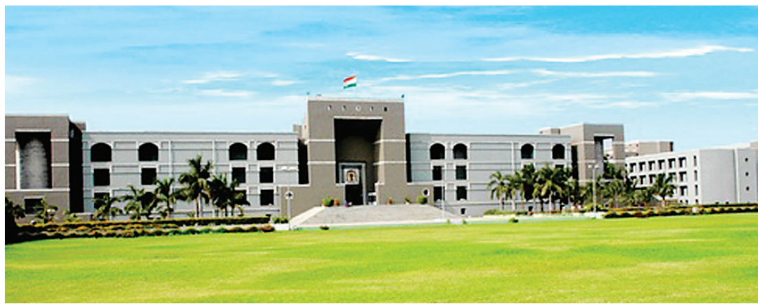
The court has directed the Secretary of the Gujarat Home Department to furnish a detailed action-taken report.