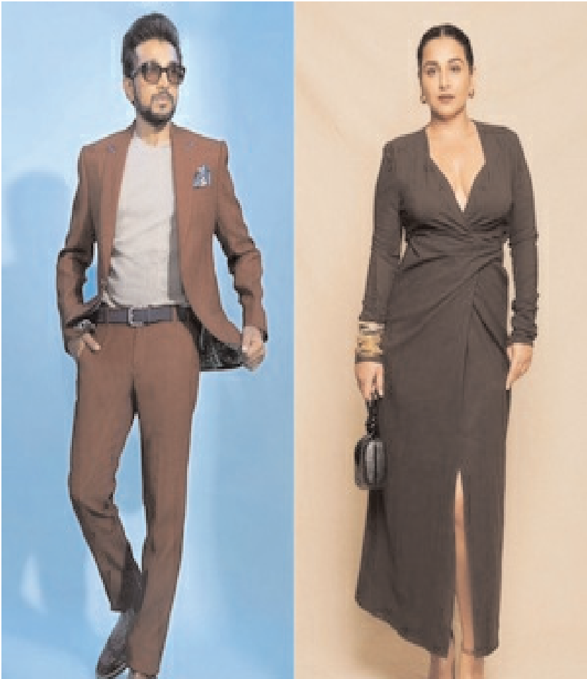
'Dedh Bigha Zameen', and 'Woh Ladki Hai Kahaan?' in the pipeline.