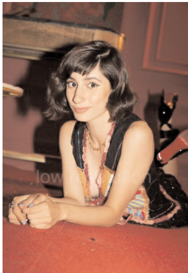
'Sunoh'. These two songs are among the top-listened songs of India across all music platforms.

She has also sung the other two chartbusters 'Dhishoom Dhishoom' and