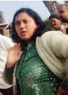
Chief Minister Mohan Yadav has instructed the officials to behave decently with the common people. Chief Minister Yadav has said that officers should use only

The government took this seriously and attached Anjali to the headquarters.