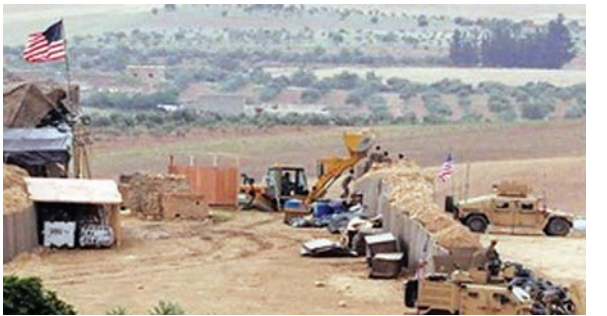
Strip. Meanwhile, the US Central Command said in a statement that three US troops were killed and dozens more injured in a drone attack on a US base in northeastern Jordan, near the Syrian border. Jordanian Minister of Government Communications Mubannad Mubaidin on Sunday also confirmed to Jordan's state-run Al Mamlaka TV that an attack had targeted the al-Tanf base in

The Islamic Resistance in Iraq, an Iraqi Shia militia, has claimed the responsibility for drone attacks on three US bases in Syria and a naval facility in Israel. The group said on Sunday in an online statement that its fighters launched explosive-laden drones on three US military bases in Syria, including the al-Shaddadi base, the al-Tanf base, and the Rukban camp near Syria's borders with Iraq and Jordan, Xinhua news agency reported.