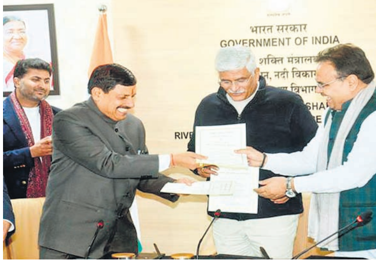
culture, industrial development and tourism will also get a boost. Like Rajasthan, 13 districts of Madhya Pradesh are also included in this scheme. Maximum benefits will be available in Malwa and Chambal

Madhya Pradesh Chief Minister Mohan Yadav said that Chambal belt is very important from the point of view of agriculture and a proper implementation of this scheme will be of great benefit. "Along with agri-