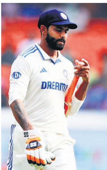
Team Absolute | New Delhi

Left-arm spin all-rounder Ravindra Jadeja and middle-order batter K.L. Rahul have been ruled out of India's second Test against England, starting in Visakhapatnam on February 2. The Board of Control for Cricket in