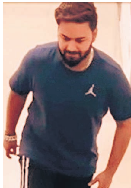
work hard to cut this recovery time," Pant said.

As the Mercedes SUV car he was driving from Roorkee to New Delhi burst into flames on that fateful day of December 30, 2022, young Indian wicketkeeper-batter Rishabh Pant for a few moments felt that his 'time in this world is up'. Pant sustained injuries to his head, back and feet including two cuts on his forehead and a ligament tear to his right knee and also hurt his right wrist, ankle and toe and suffered abrasion injuries to his back. He underwent plastic surgery for his facial injuries, lacerations and abrasions. In a candid conversation with Star Sports 'Believe' series, featuring real heroes of the game who have overcome the odds to become champions, Rishabh Pant delved into the harrowing experience that nearly cost him his life and the remarkable resilience that propelled him towards redemption. Pant narrated his journey towards glory for the first time and the programme will be exclusively broadcast on Star Sports Network on Thursday (February 1), 7 PM onwards. In the promo shared by Star Sports, Pant vividly recounted the chilling moments of his near-fatal car accident at the end of 2022. "First time in my life I felt like my time in this world was up. During the accident, I was aware of the wounds, but I was lucky as it could have been even more serious. I felt that someone saved me. I asked the doctor how long will it take for me to recover, he said it would take 16-18 months. I knew I had to