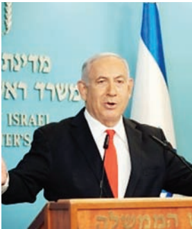
believed to have been held in Paris. Ronen Bar, the head of the Israeli Shin Ben security service, as well as IDF hostage envoy Nitzan Alon were also at the four nation summit.

The Israel Prime Minister's Office said that the peace talks held for a ceasefire and the release of all its hostages from Hamas custody were constructive. The office of Prime Minister Benjamin Netanyahu in a statement on Sunday night confirmed that a four way meeting involving US, Israel, Qatar and Egypt had taken place in Europe and was quite constructive.