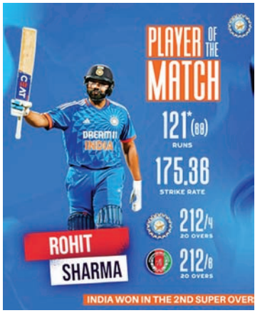
Bengaluru

India beat Afghanistan in a double super over to complete a 3-0 lead in the 5-match T20I series at the M Chinnaswamy Stadium on Wednesday. With this victory against Afghanistan, Skipper Rohit Sharma