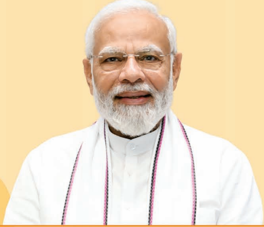
नरेन्द्र मोदी, प्रधानमंत्री