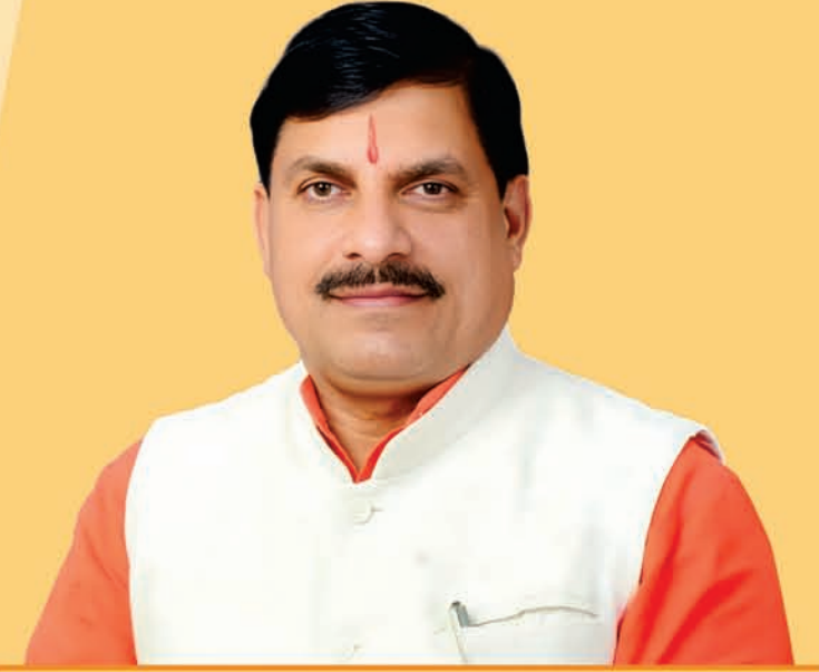
डॉ. मोहन यादव, मुख्यमंत्री

“प्रधानमंत्री श्री नरेन्द्र मोदी के नेतृत्व में देश आगे बढ़ रहा है। 21वीं सदी के भारत में अपार संभावनाएं छुपी हुई हैं। हम प्रधानमंत्री जी के मार्गदर्शन में मध्यप्रदेश को जनहित और विकास में सबसे अग्रणी राज्य बनाने के लिए प्रतिबद्ध हैं।”