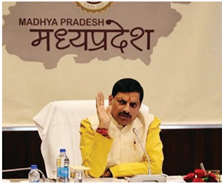
He also said that everyone has an opportunity to celebrate Diwali on