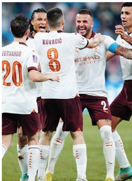
win it with three different clubs, after his successes with Real Madrid and Chelsea.

Meanwhile, Pep Guardiola can become the first manager to win the Club World Cup four times, and Kovacic can be the first player to