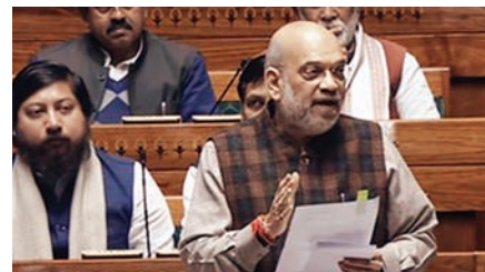
Team Absolute | New Delhi

The Lok Sabha (LS) on Tuesday passed three amended criminal bills -- Bharatiya Nyaya (Second) Sanhita, 2023; Bharatiya Nagarik Suraksha (Second) Sanhita, 2023; and Bharatiya Sakshya (Second) (BSB) 2023. The Lok Sabha also passed the Telecommunications Bill, 2023, with voice vote. The three Bills were passed after Home Minister Amit Shah spoke in the House and majority of MPs present in the Lower House voted in favour of the bills by voice vote.