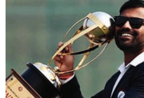
January, 2024 (Tuesday) at 1100 hours," the Sports Ministry said in an official statement.

"Ministry of Youth Affairs & Sports announced the National Sports Awards 2023 today. The awardees will receive their awards from the President of India at a specially organized function at Rashtrapati Bhavan on 09th