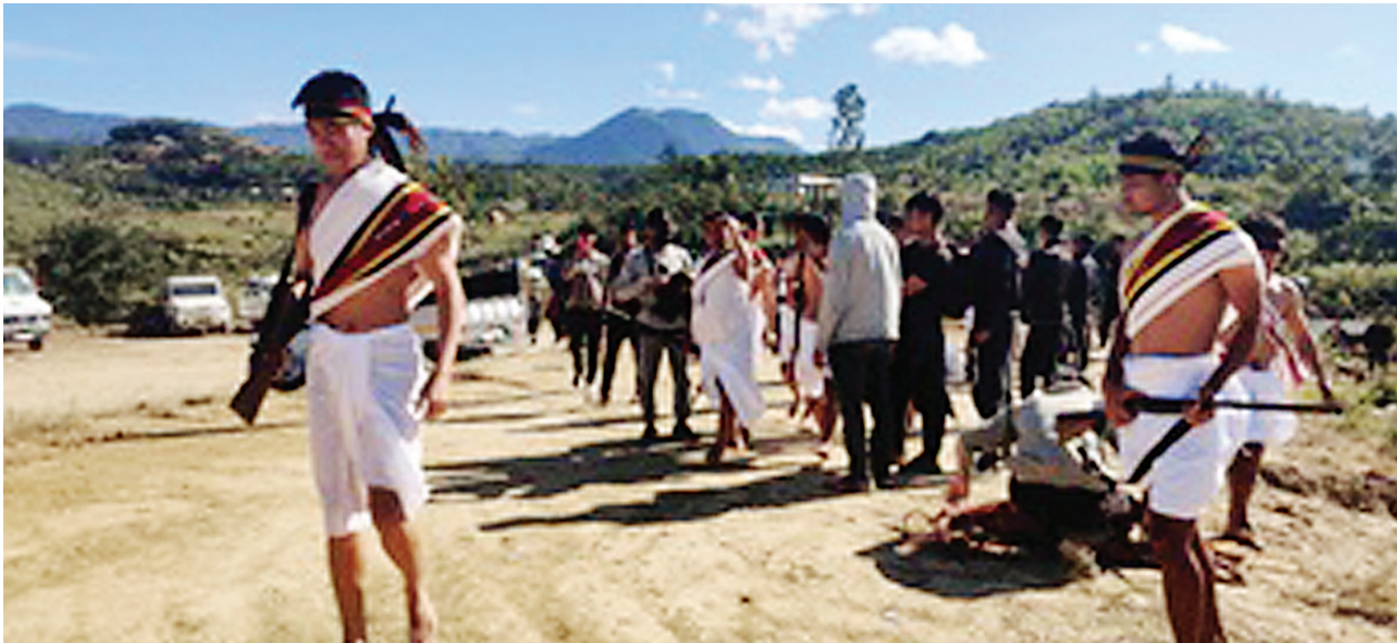
in tribal dominated Churachandpur. Amid the heavy security and prohibitory orders in Churachandpur district, the mass burial took place following the customary and religious rituals and numerous performances.

The tribal volunteers gave gun salutes in respect towards the slain people, whom they termed as "martyrs". Before the burial, a condolence service and mass prayers were organised at the ground in Tuibuong