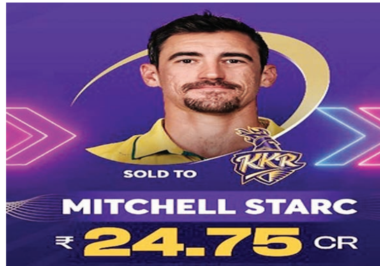
Healy, who is in India leading the Women's team in a multi-format series against Harmanpreet Kaur's Indian team, faced questions on the

Starc was picked by Kolkata Knight Riders for a record-breaking bid of Rs 24.75 crore on Tuesday. He broke the record set a few minutes before by his World Cup-winning captain Pat Cummins, who became the first player to breach the Rs 20 crore mark when he was picked by Sunrisers Hyderabad for Rs 20.50 crore.